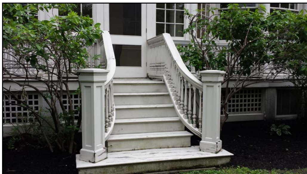
2 EXISTING PORCH LATTICE/SCREENING, HANDRAILS & NEWELS SK-2 SCALE: N/A