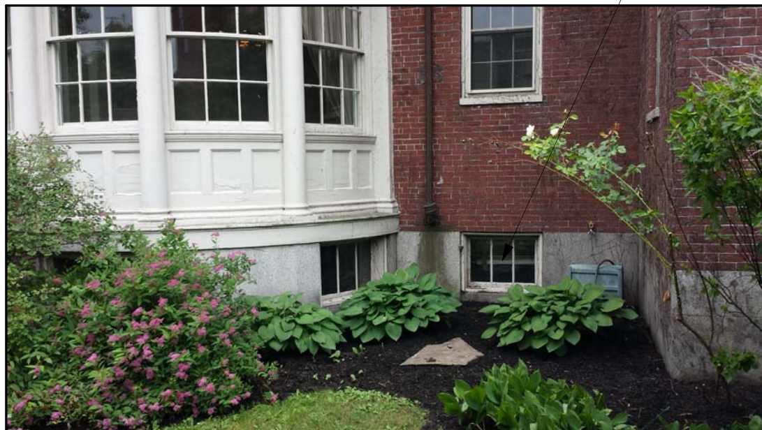
1 EXISTING EXTERIOR CONDITIONS SK-2 SCALE: N/A

NEW LINE-SETS TO COME THROUGH EXISTING WINDOW PANE NO NEW MASONRY PENETRATIONS REQUIRED