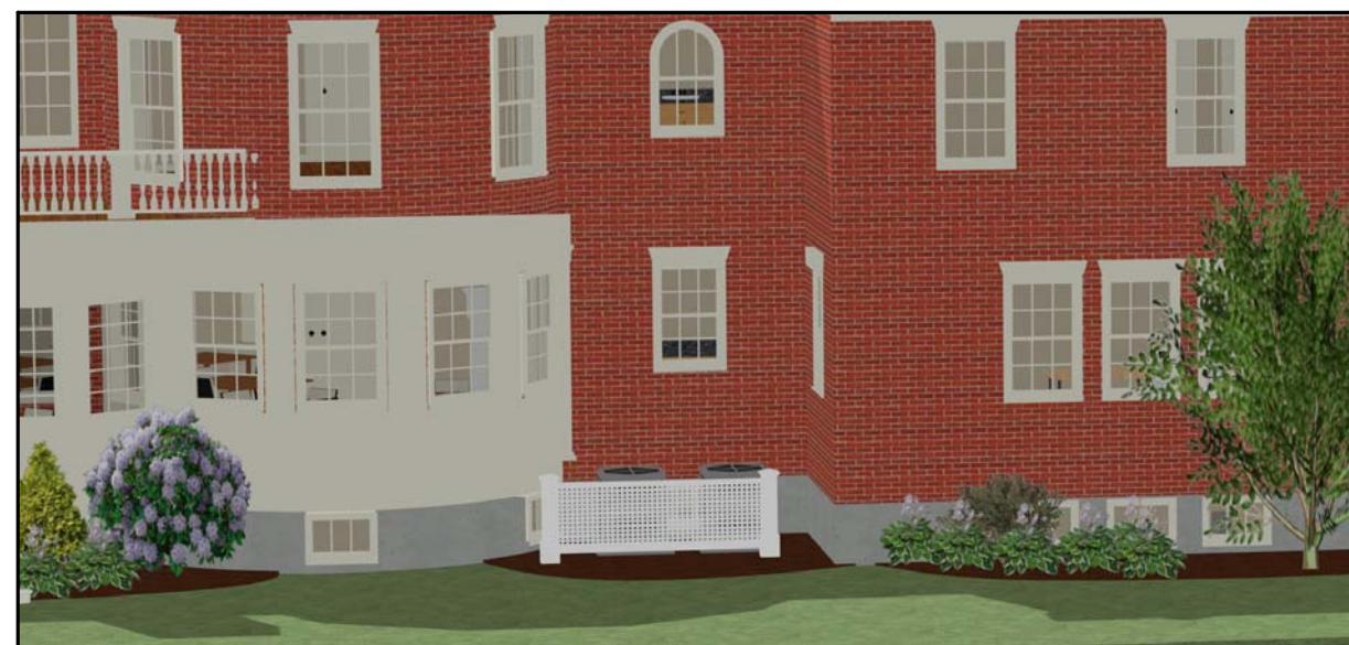
4 RENDERING SHOWING PROPOSED A/C SCREENING SK-2 SCALE: N/A