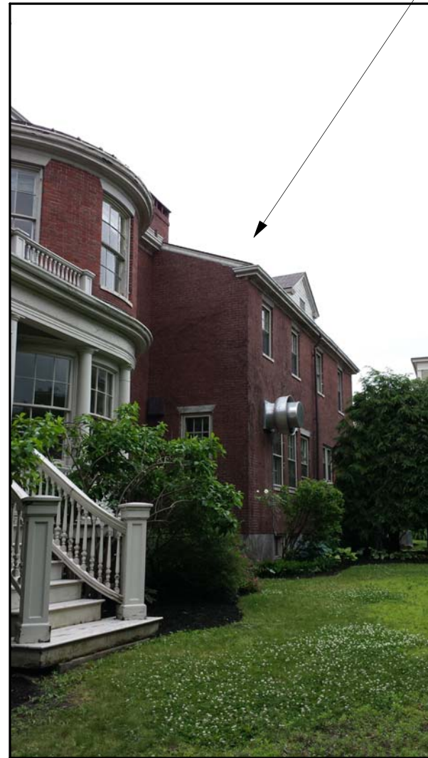
1 EXISTING EXTERIOR VENT CONDITIONS SK-1 SCALE: N/A