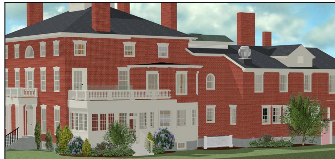
3 RENDERING SHOWING PROPOSED ROOF-TOP VENT SK-1 SCALE: N/A