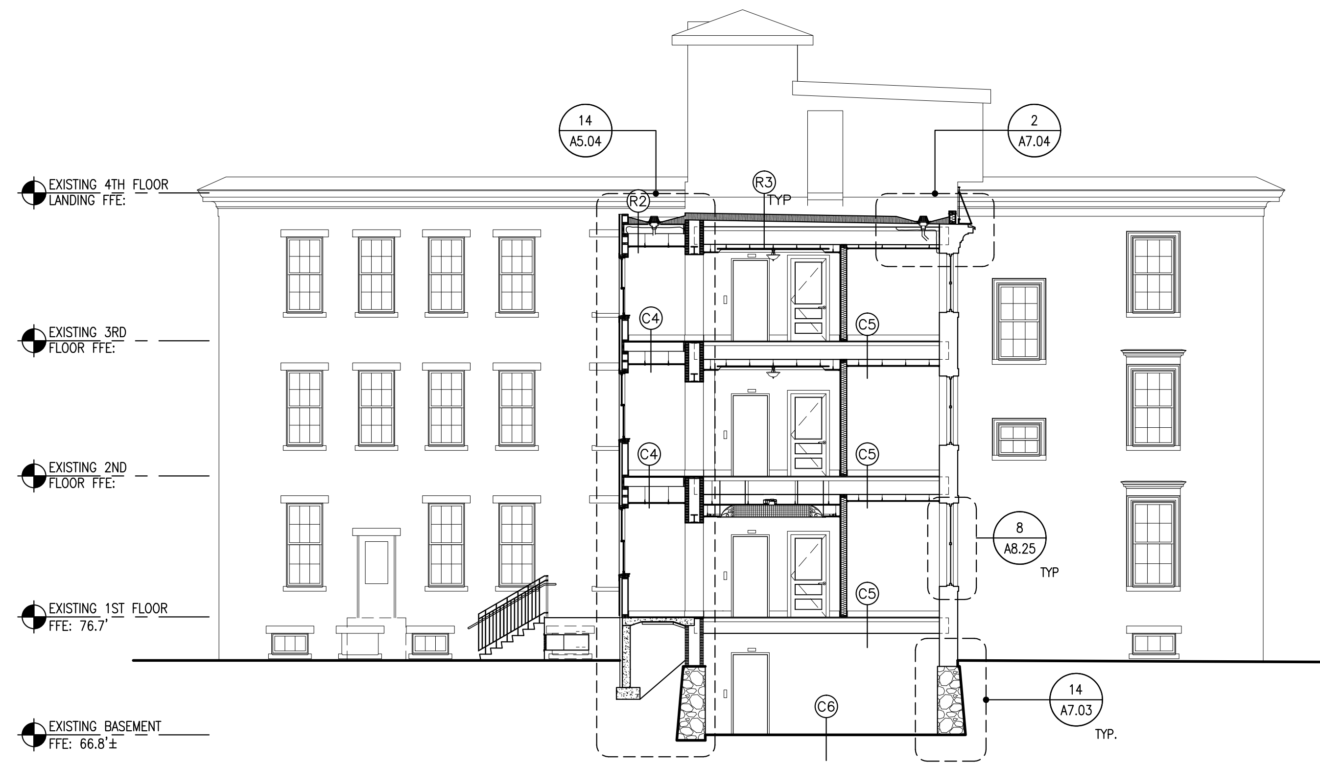
3 WEST SECTION