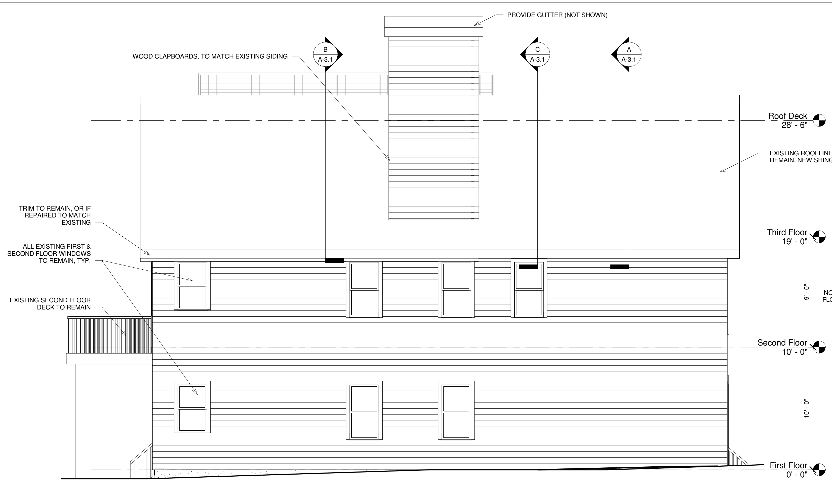
(A) NORTH 1/4" = 1'-0"