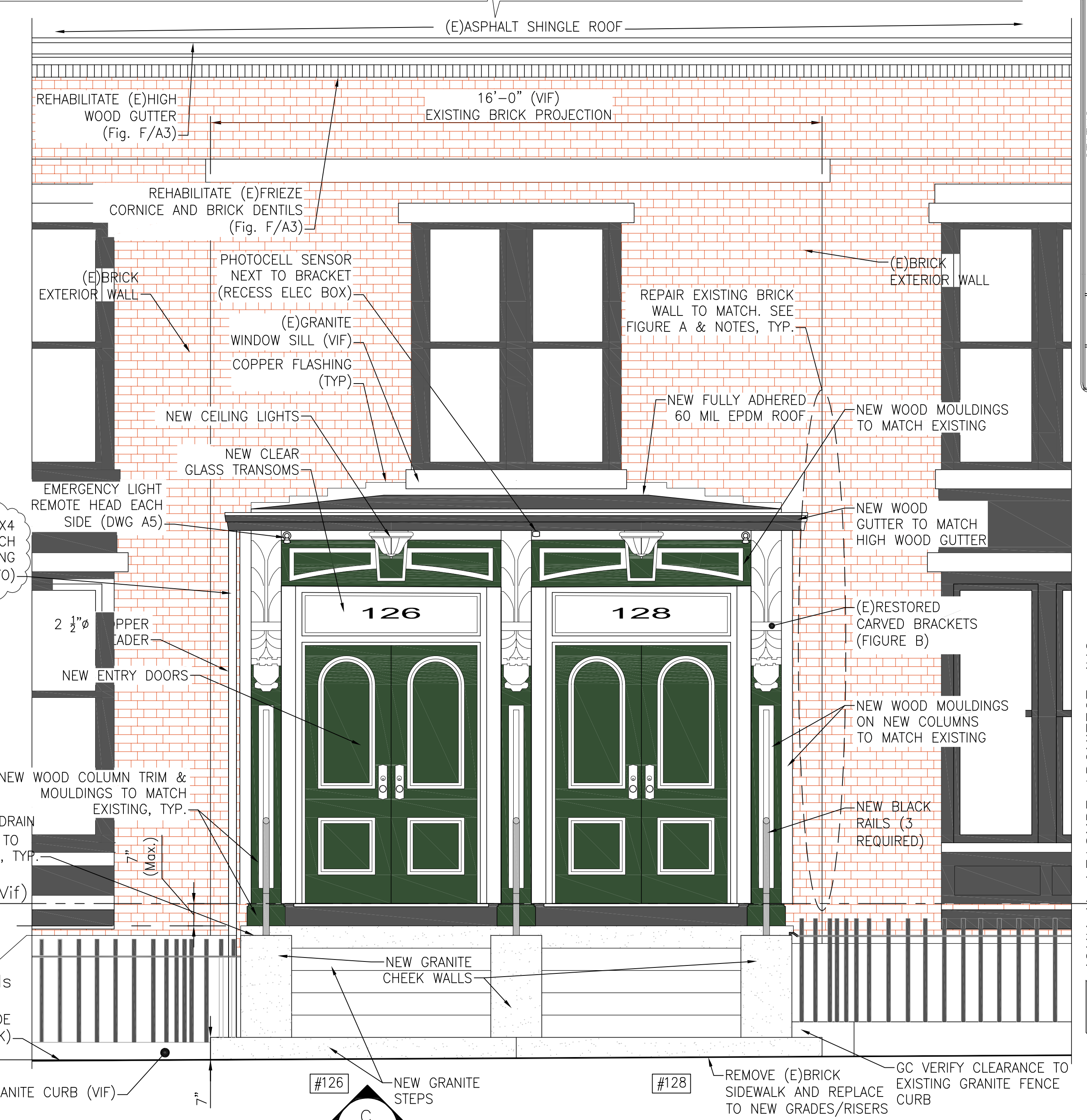
DANFORTH STREET ELEVATION SCALE: 1/2 = 1'-0"