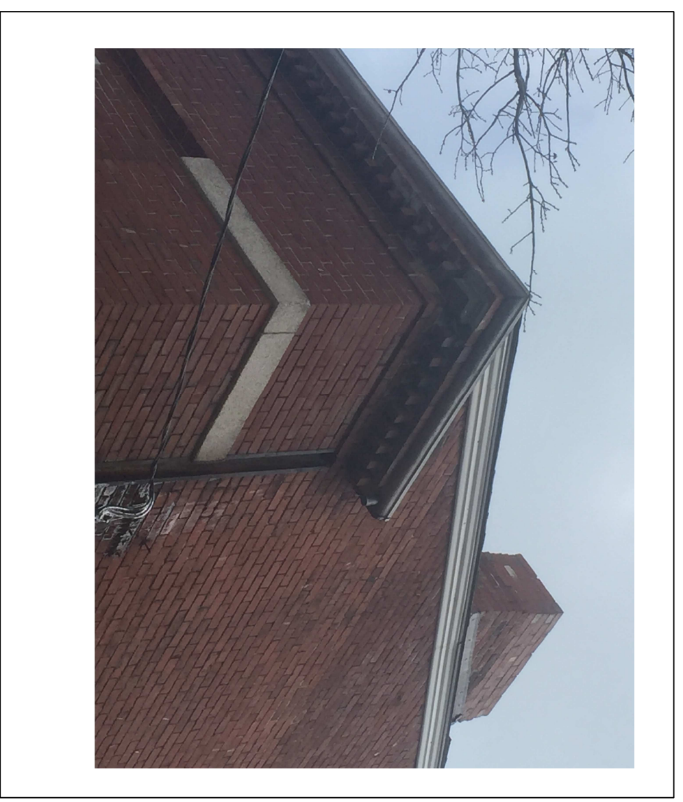
FIGURE F 126-128 Danforth Street Northwest High Roof Corner