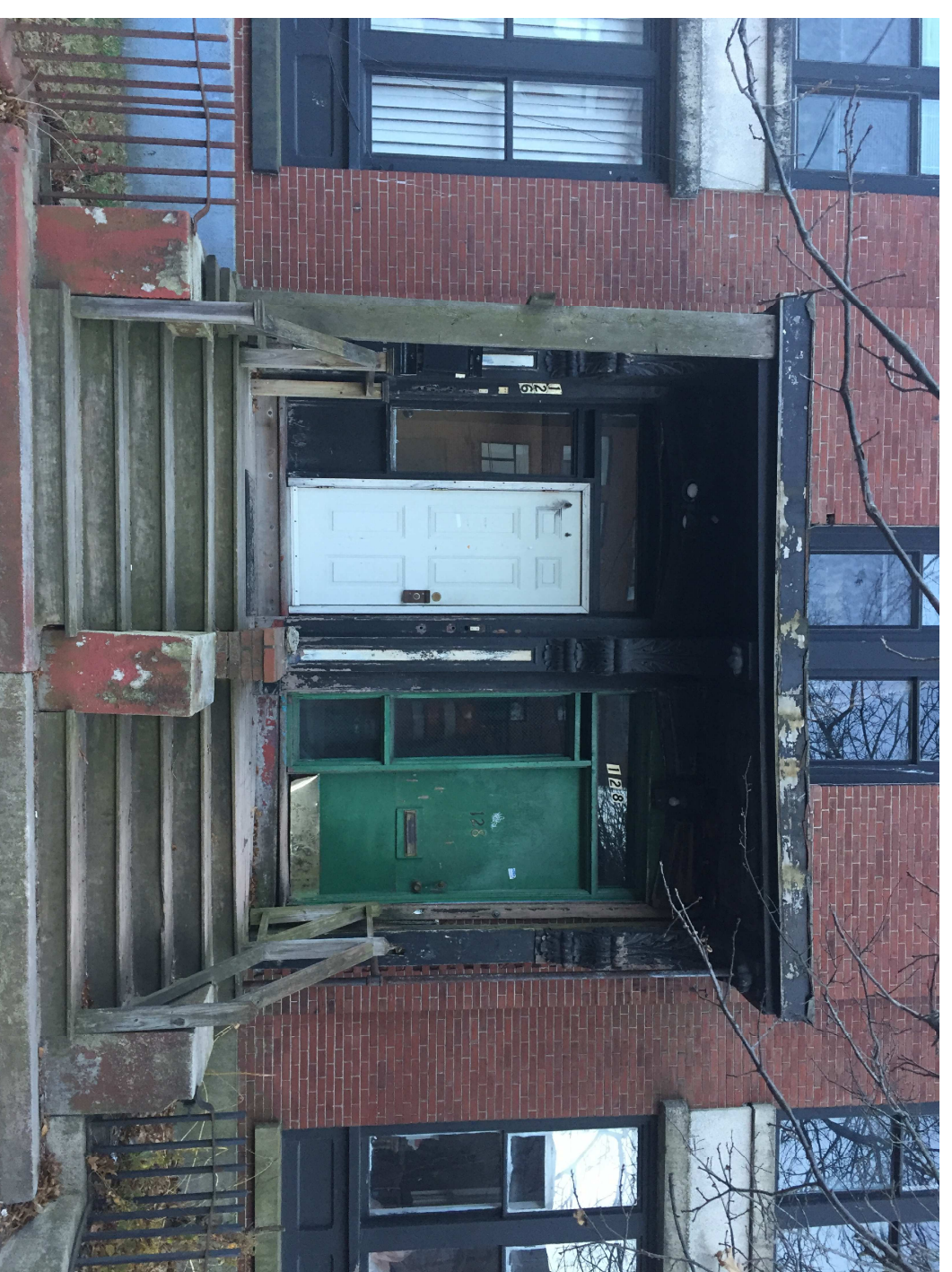
FIGURE C Danforth Street Front Elevation