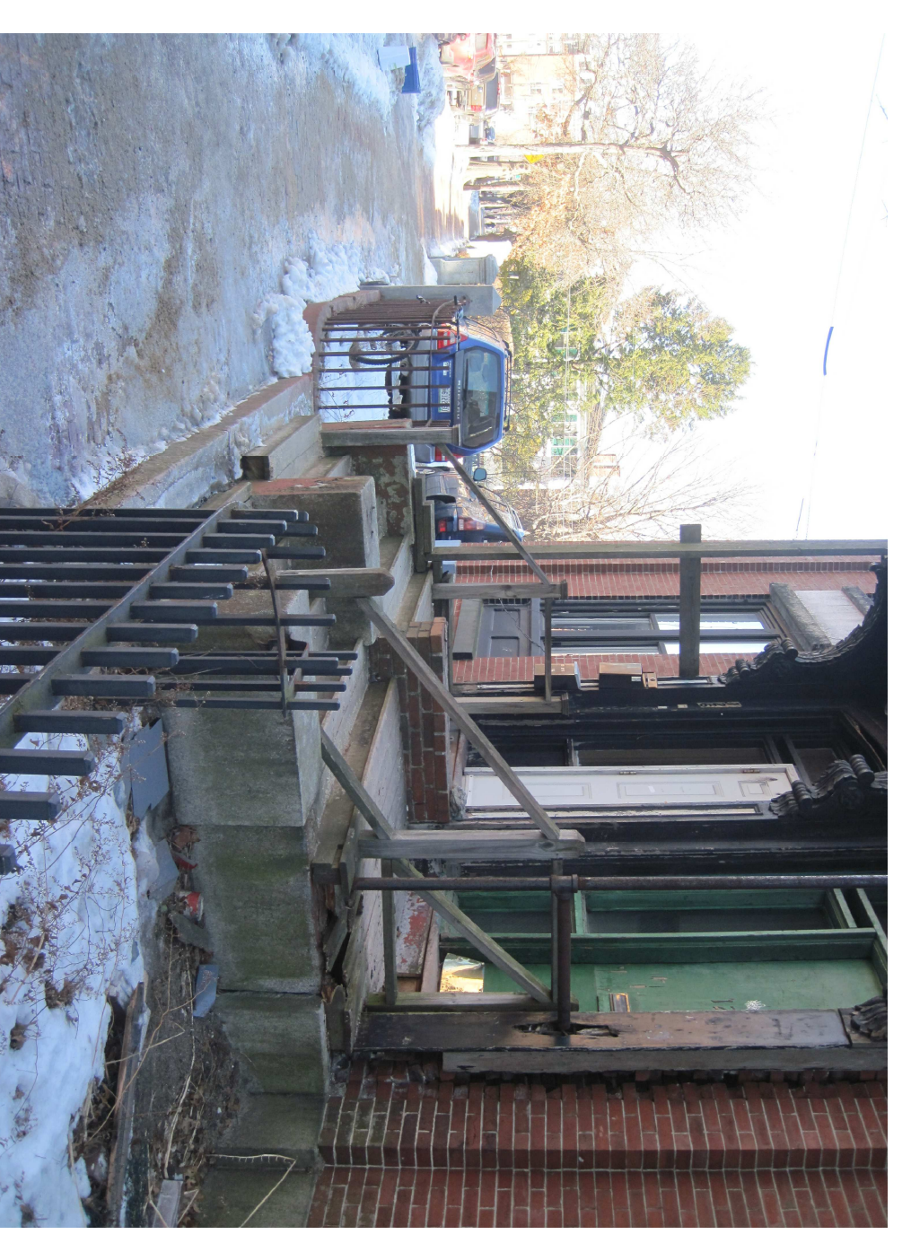
FIGURE E Danforth Street Looking East