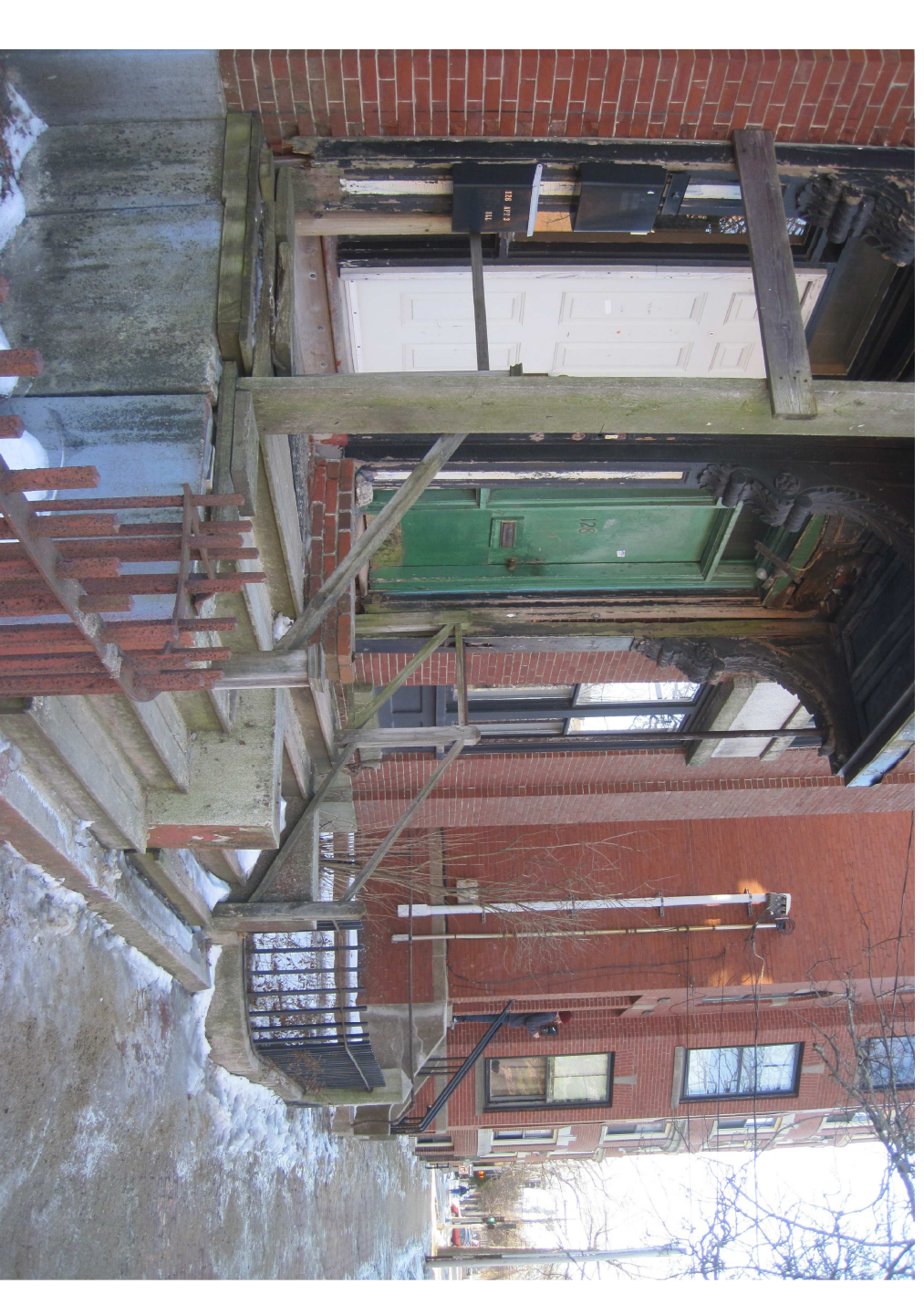
FIGURE D Danforth Street Looking West