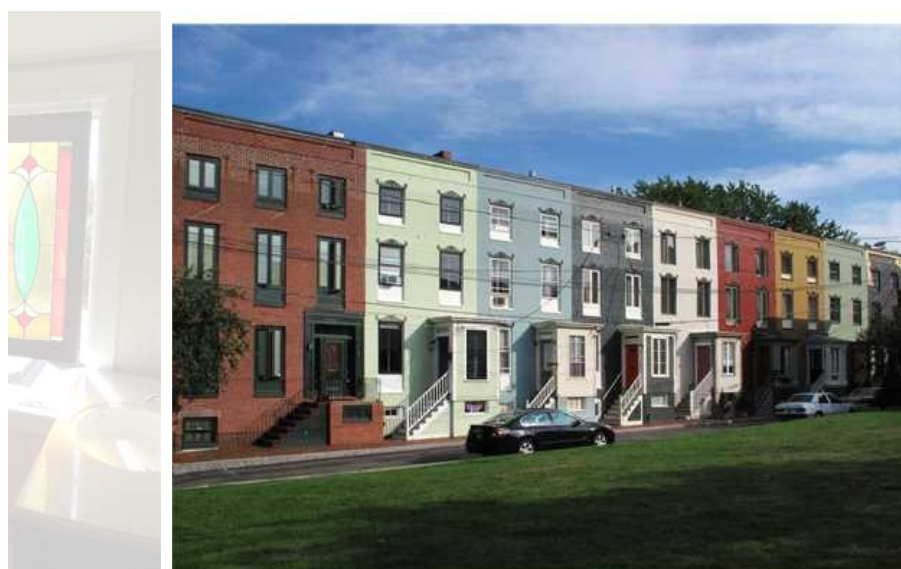
Street View, with green space at front door 1 of 18