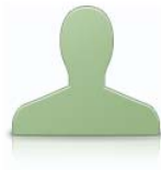
Painter in Residence Alamo, California

There are 2 people looking at this rental.