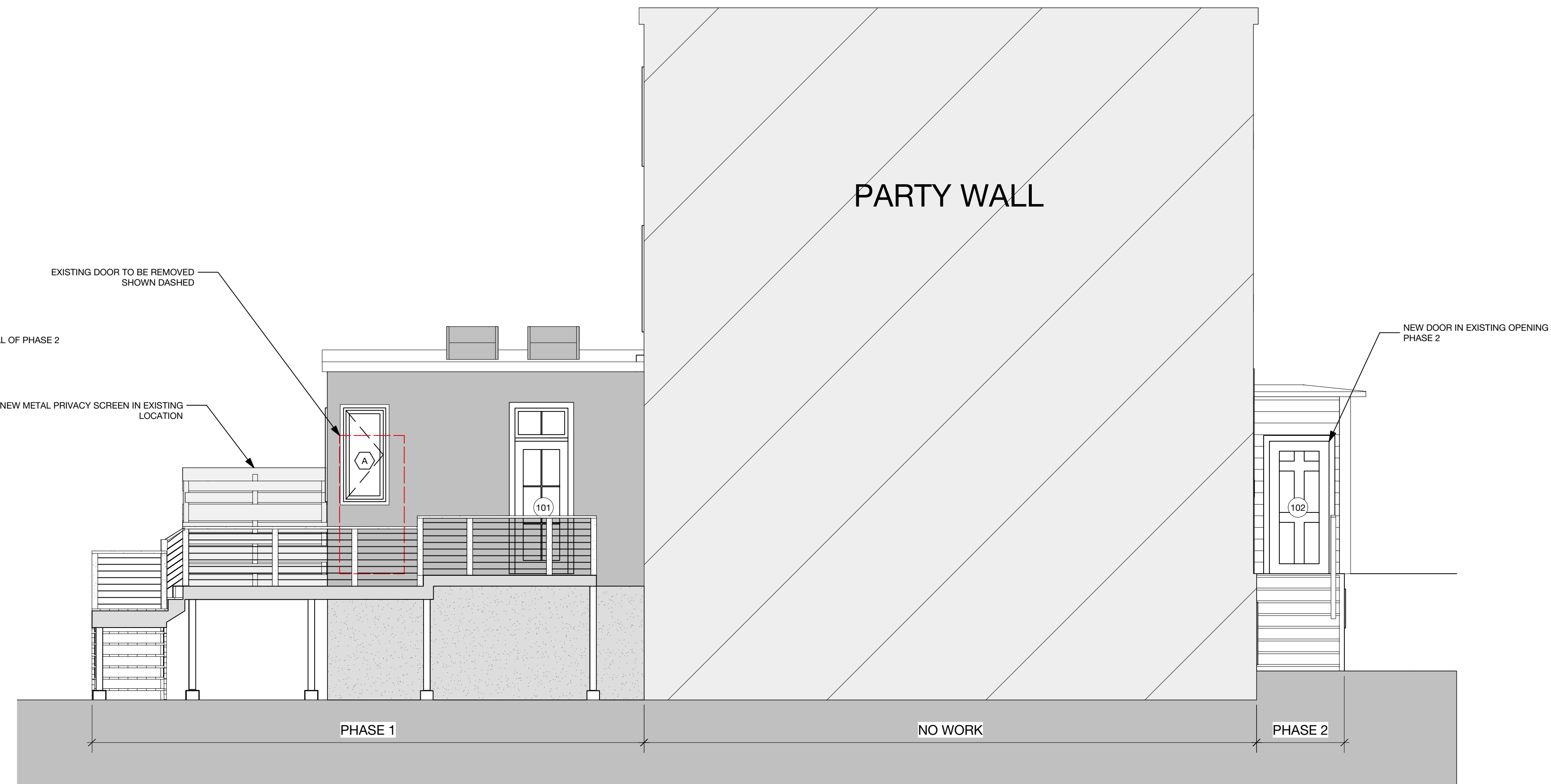
2 SIDE ELEVATION Scale: 1/4" = 1'-0"