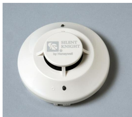
SK-Photo (Base included)