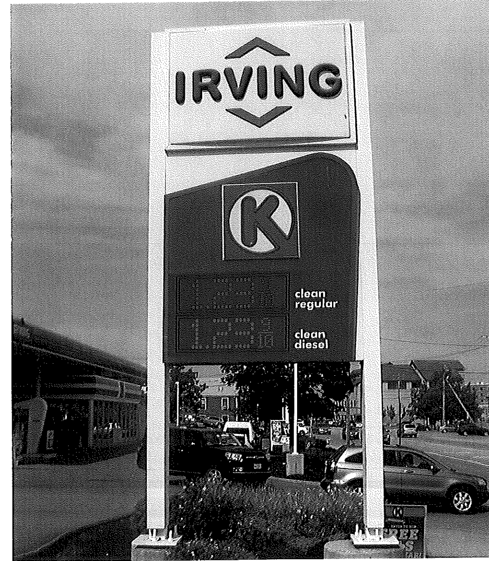
D Proposed Not to Scale