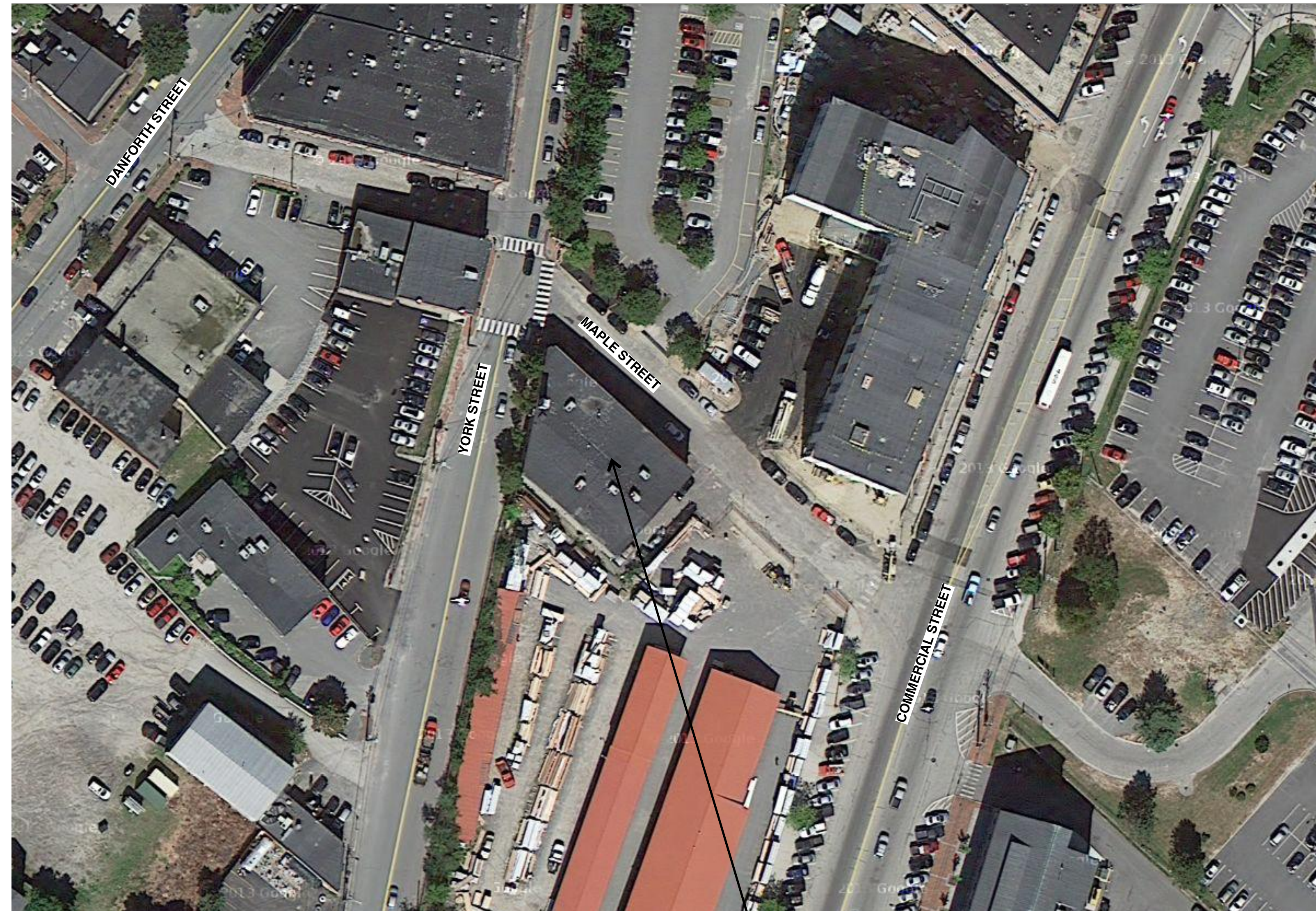
BAXTER ACADEMY 54 YORK STREET, PORTLAND, MAINE