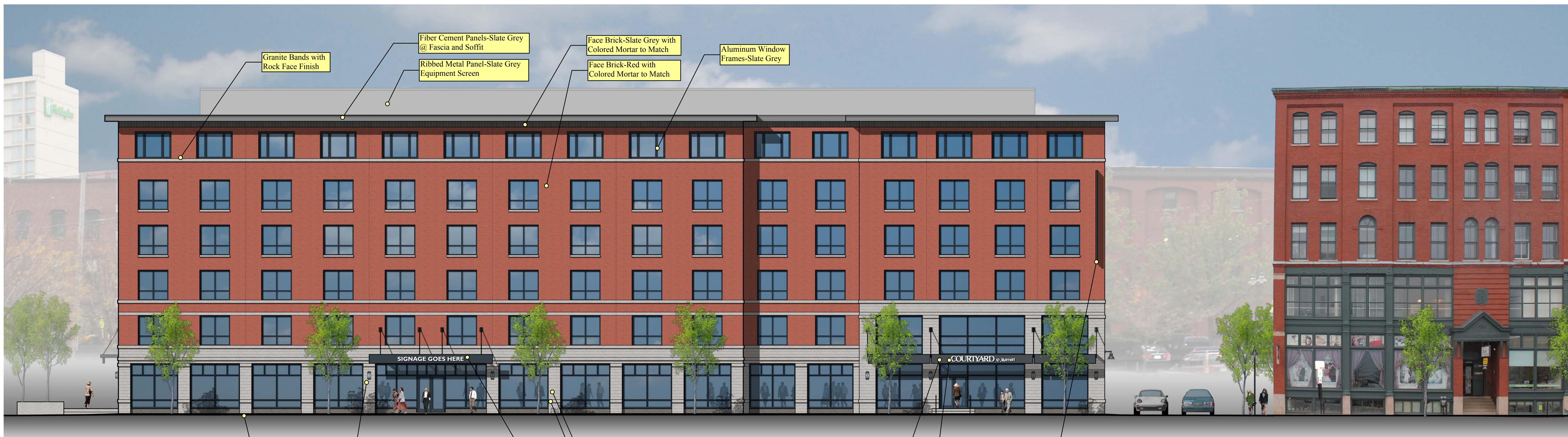
COMMERCIAL STREET ELEVATION