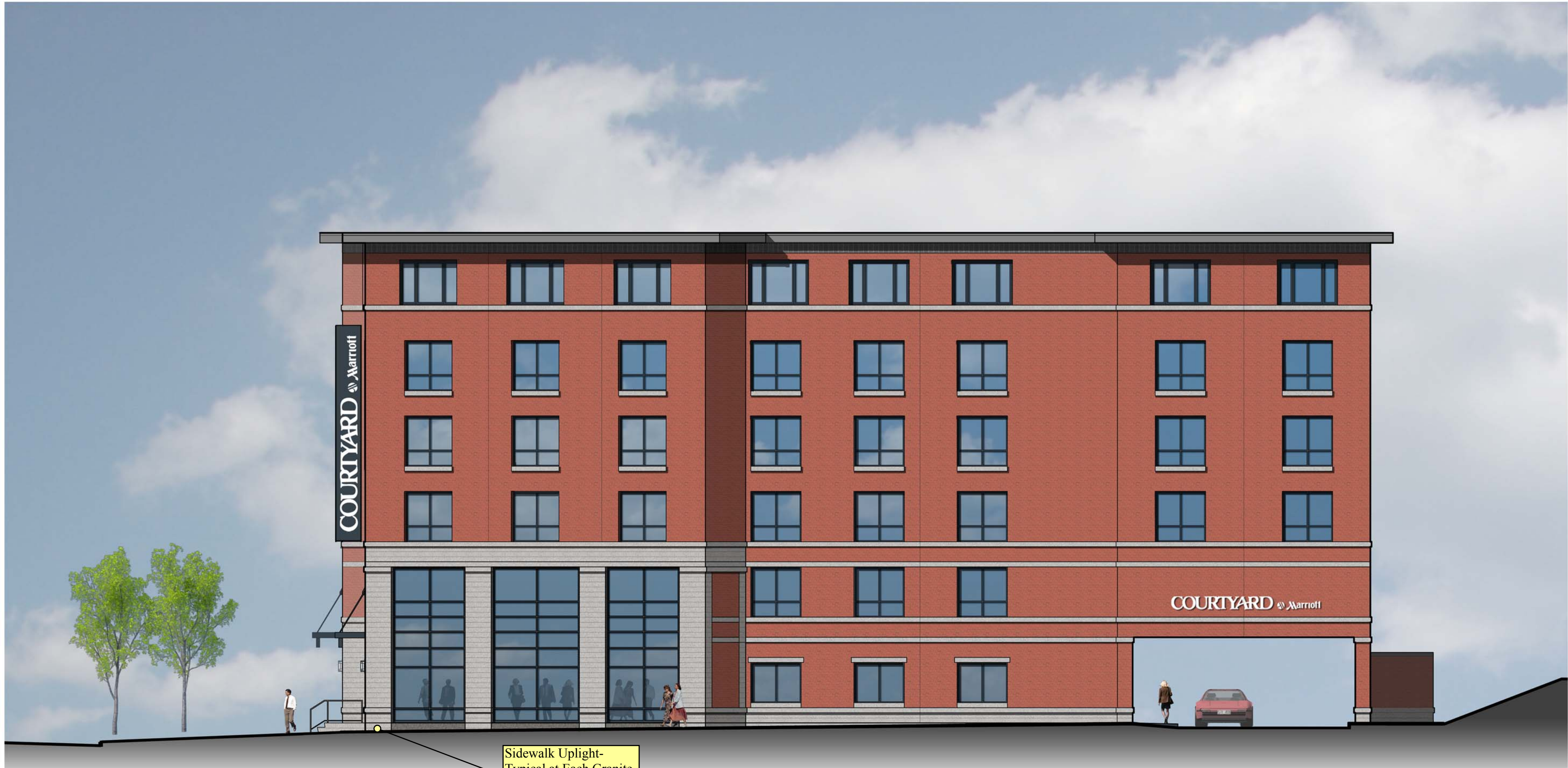
FOUNDRY LANE ELEVATION