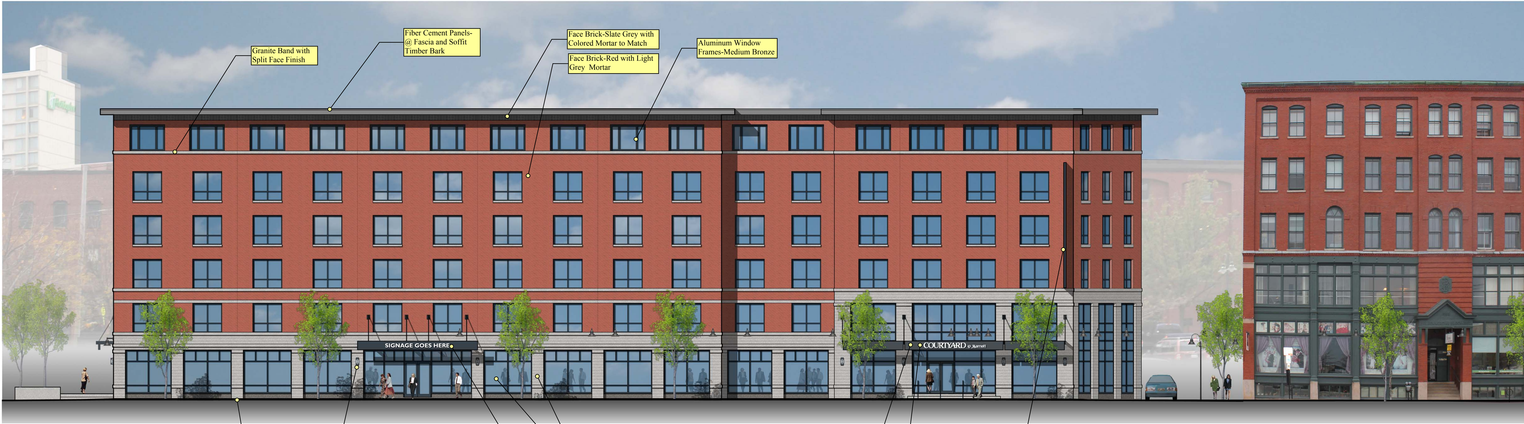
COMMERCIAL STREET ELEVATION