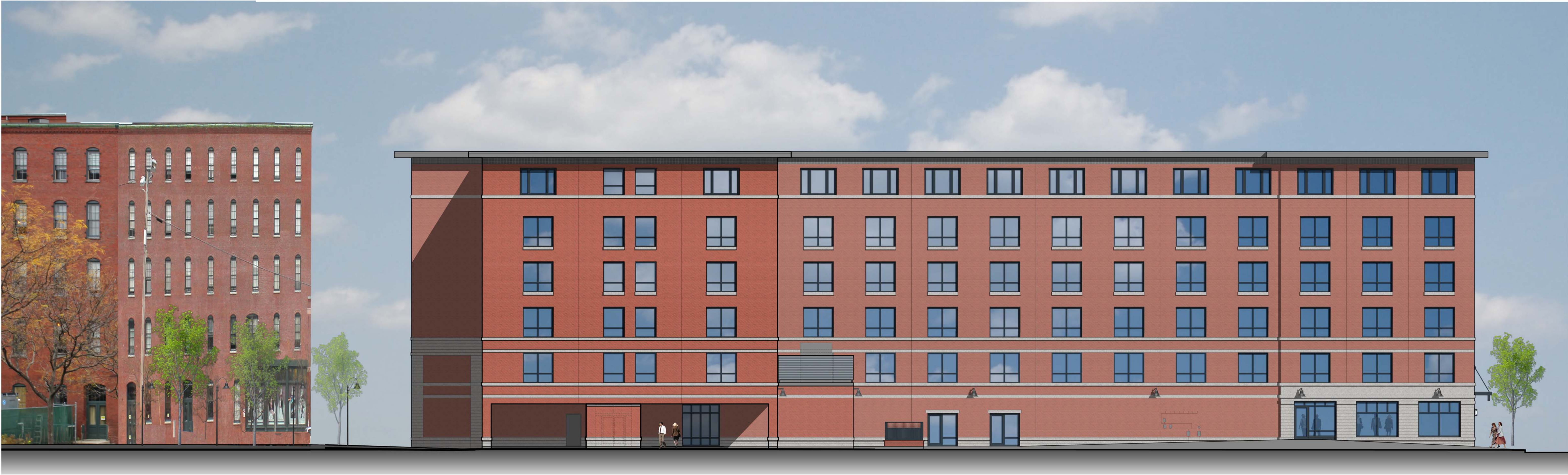
YORK STREET ELEVATION