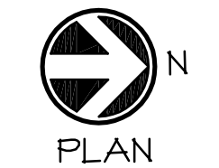
1 SECOND FLOOR PLAN A2 1/8" = 1'-0"