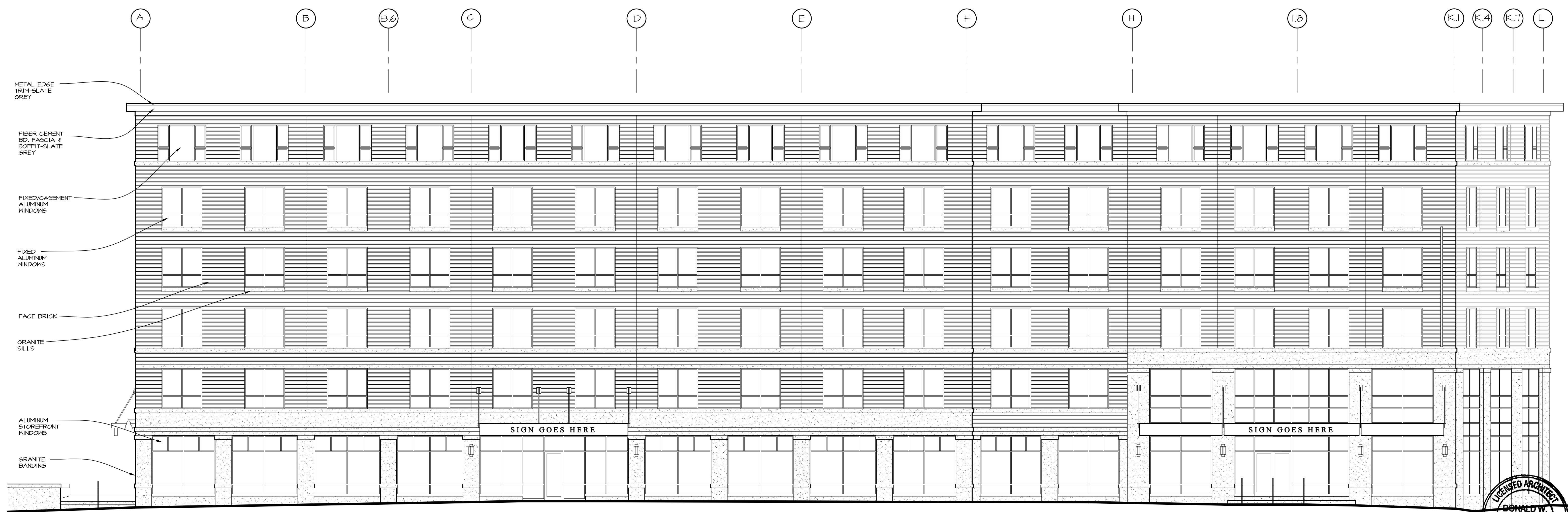
2 COMMERCIAL STREET ELEVATION 1/8" = 1'-0"