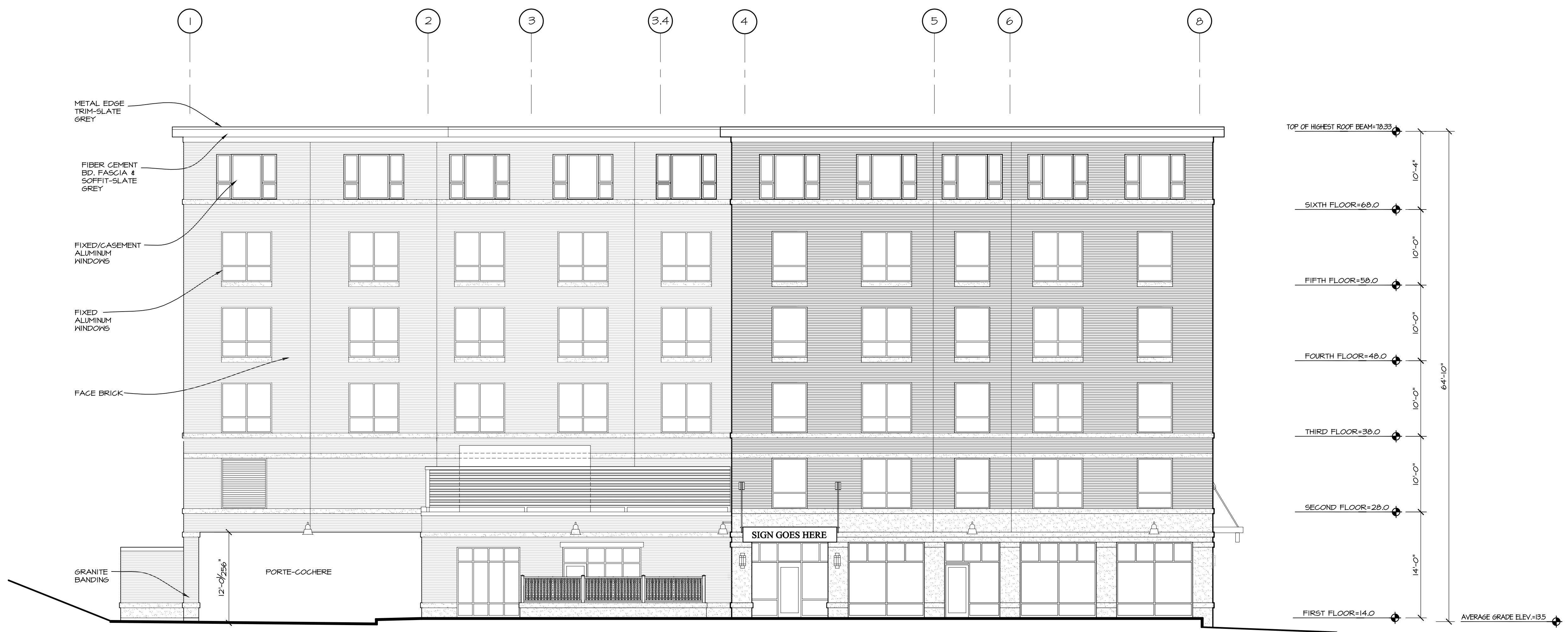
1 MAPLE STREET ELEVATION 1/8" = 1'-0"