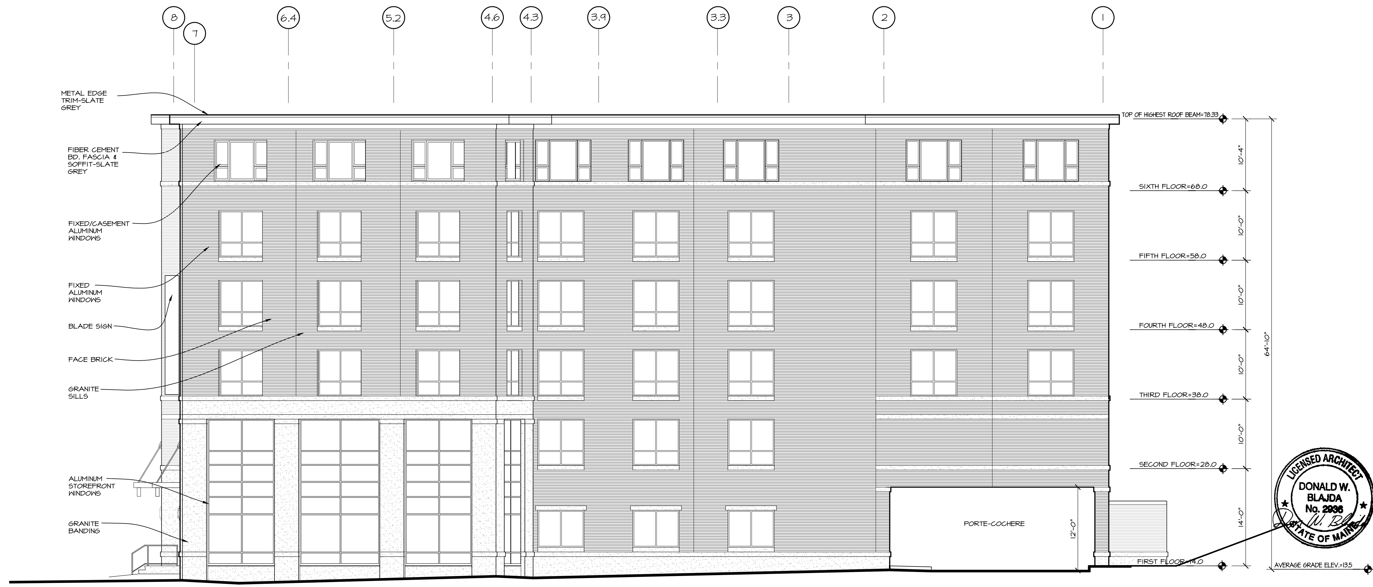
2 FOUNDRY LANE ELEVATION 1/8" = 1'-0"