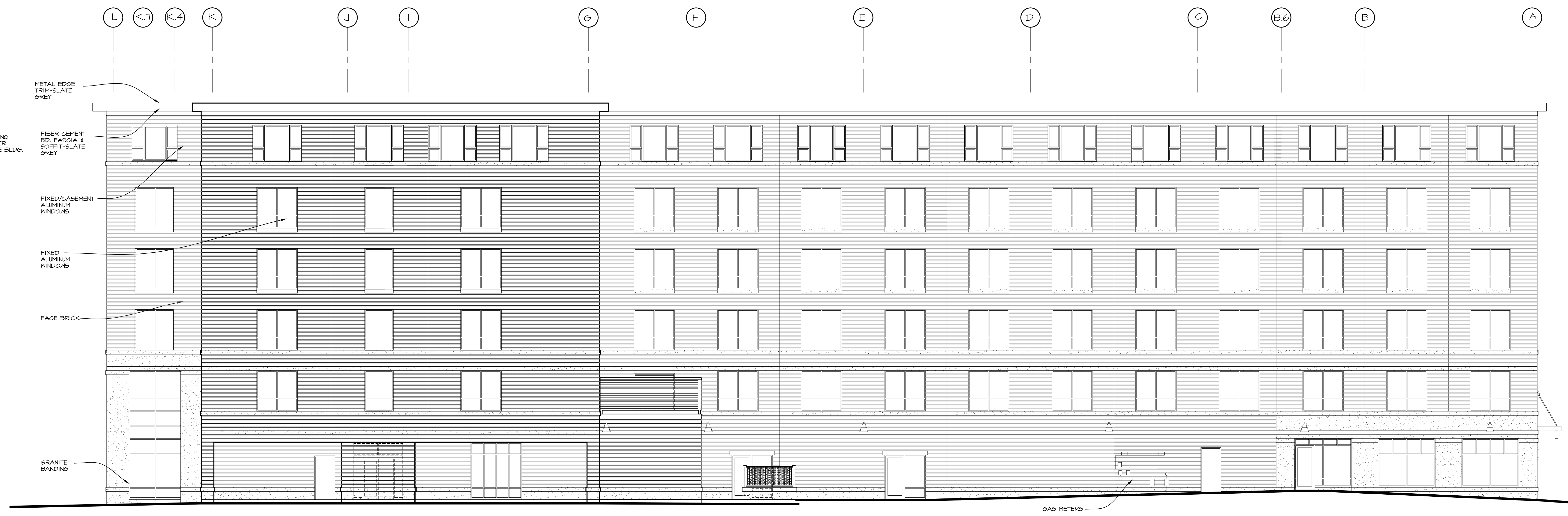
1 YORK STREET ELEVATION 1/8" = 1'-0"