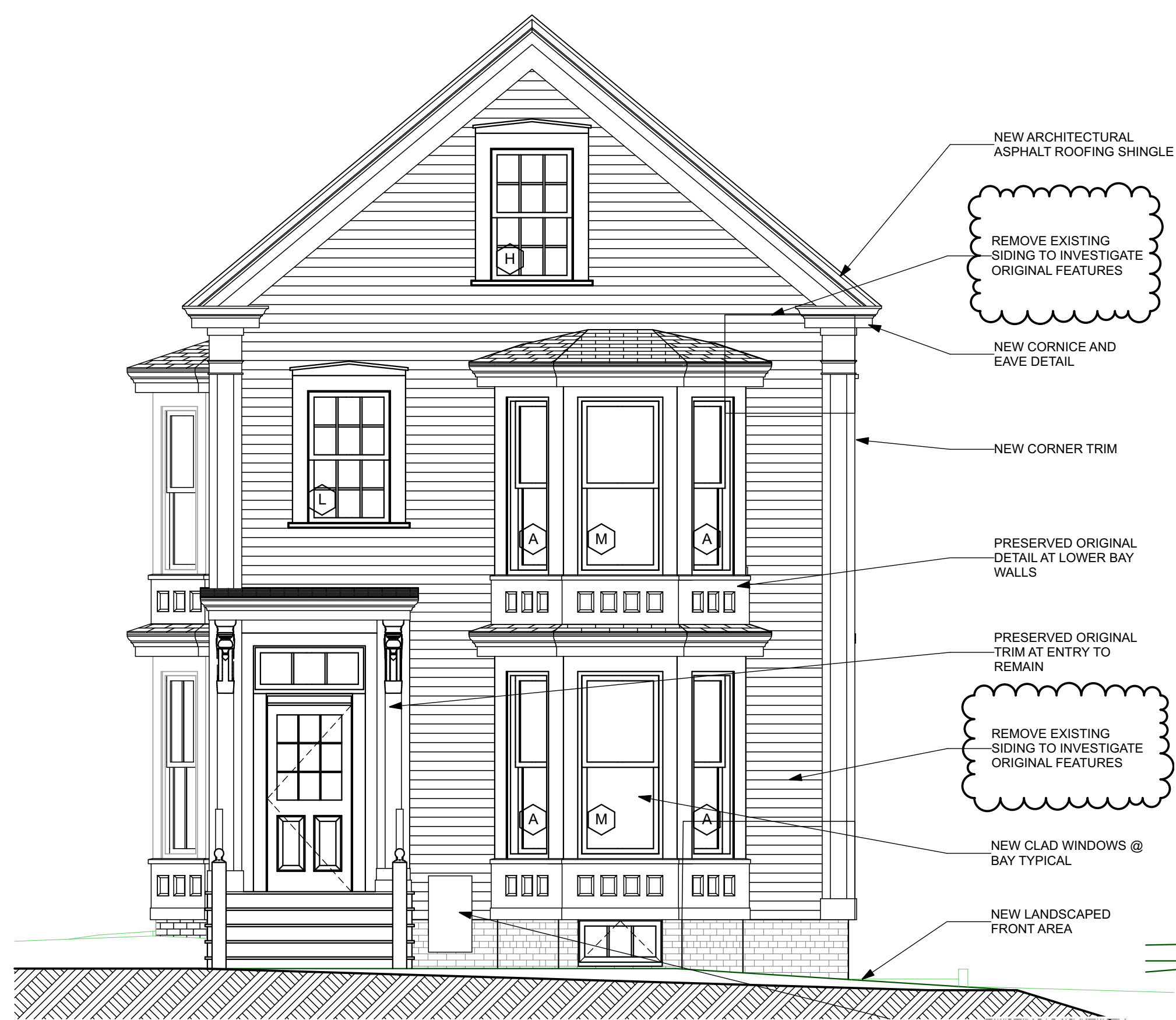
3 FRONT ELEVATION - HIGH STREET SCALE: 1/4" = 1'-0"