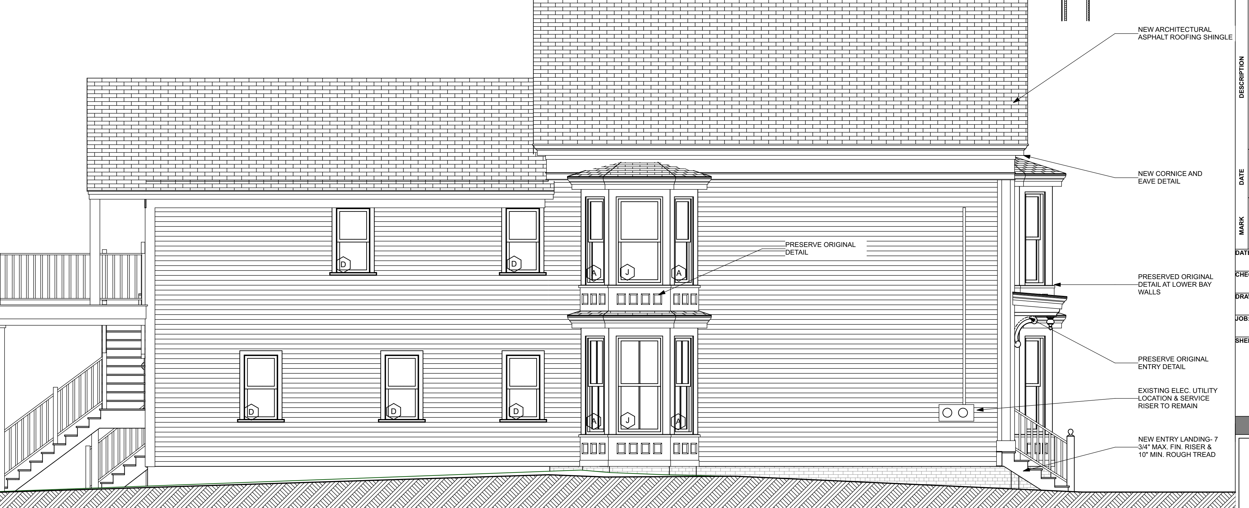
4 SIDE ELEVATION - NORTH SCALE: 1/4" = 1'-0"