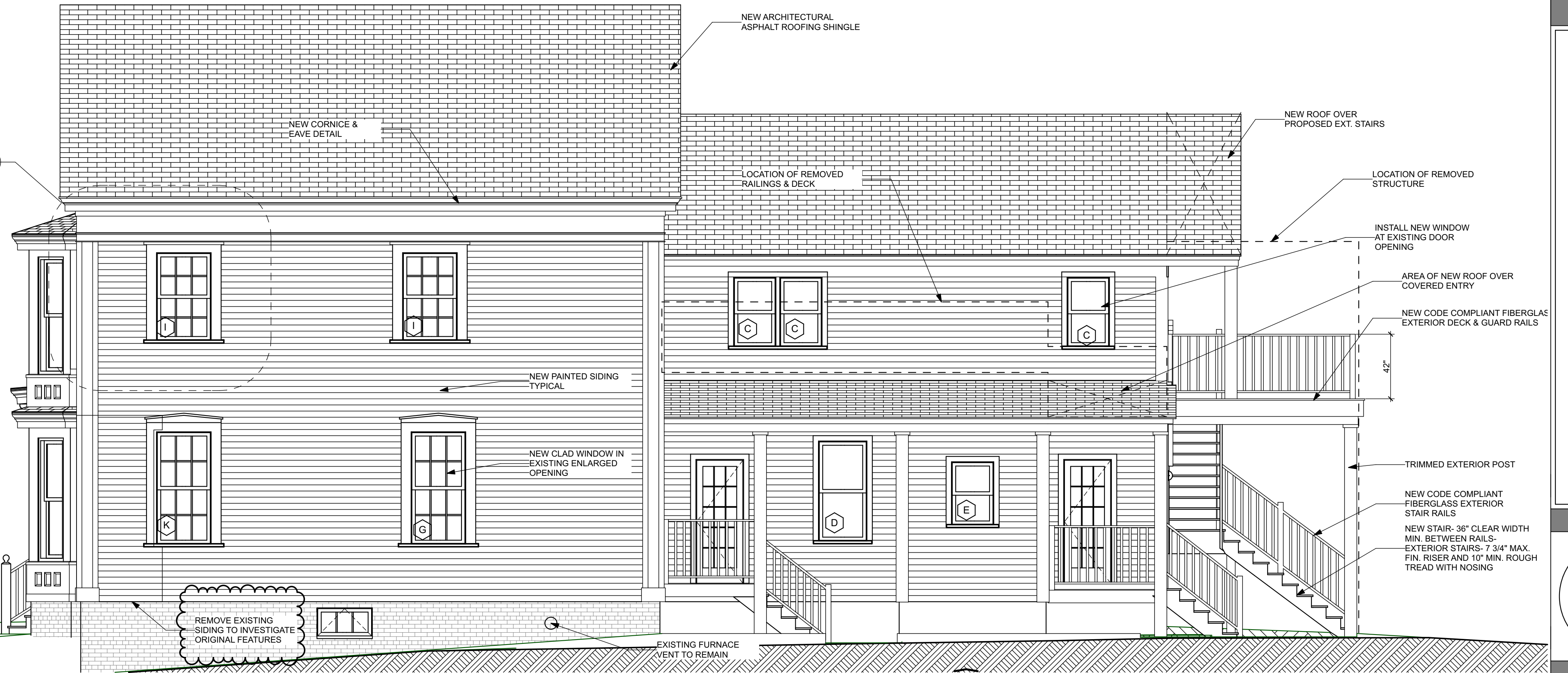
2 SIDE ELEVATION - SOUTH SCALE: 1/4" = 1'-0"