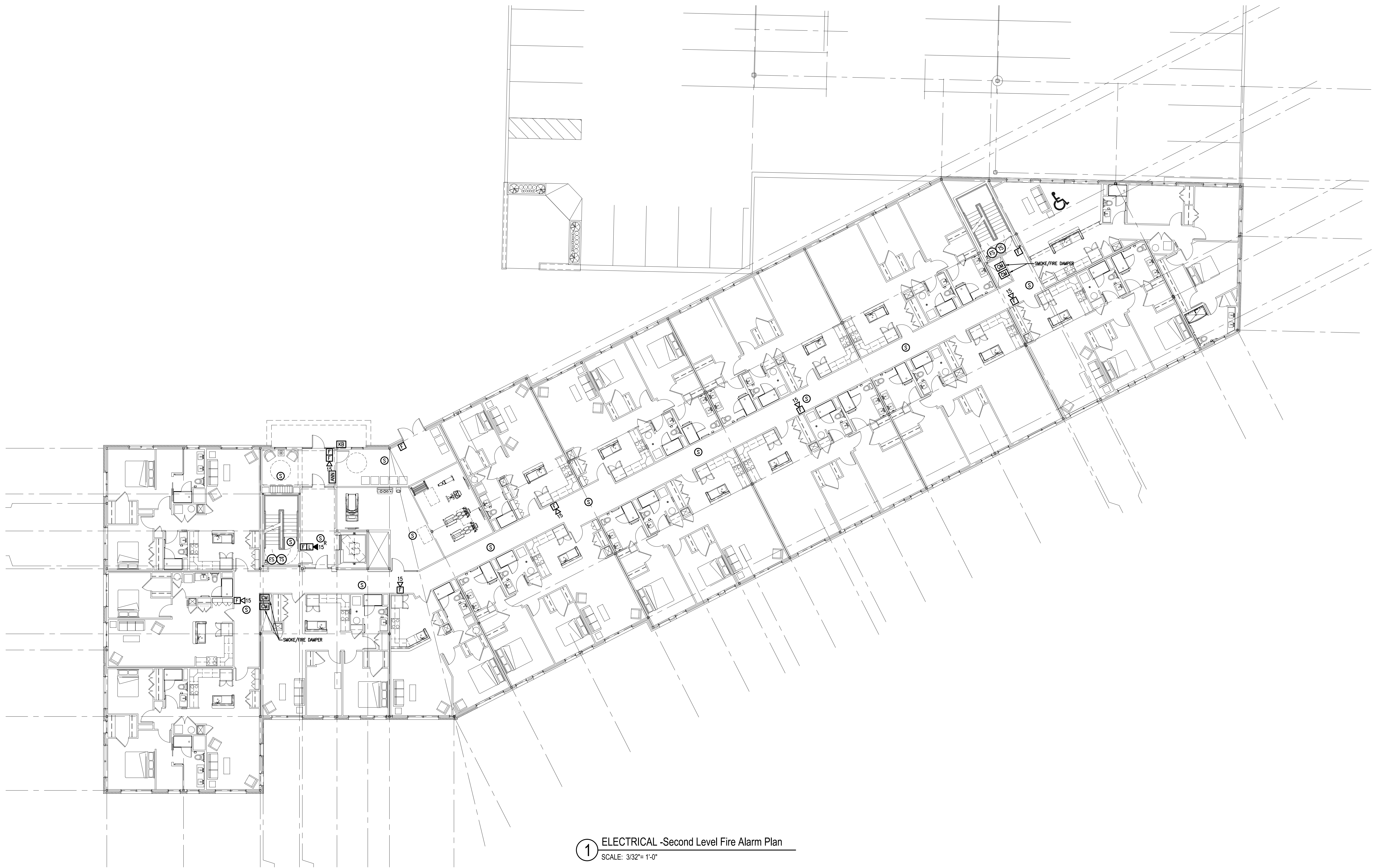
1 ELECTRICAL -Second Level Fire Alarm Plan SCALE: 3/32" = 1'-0"