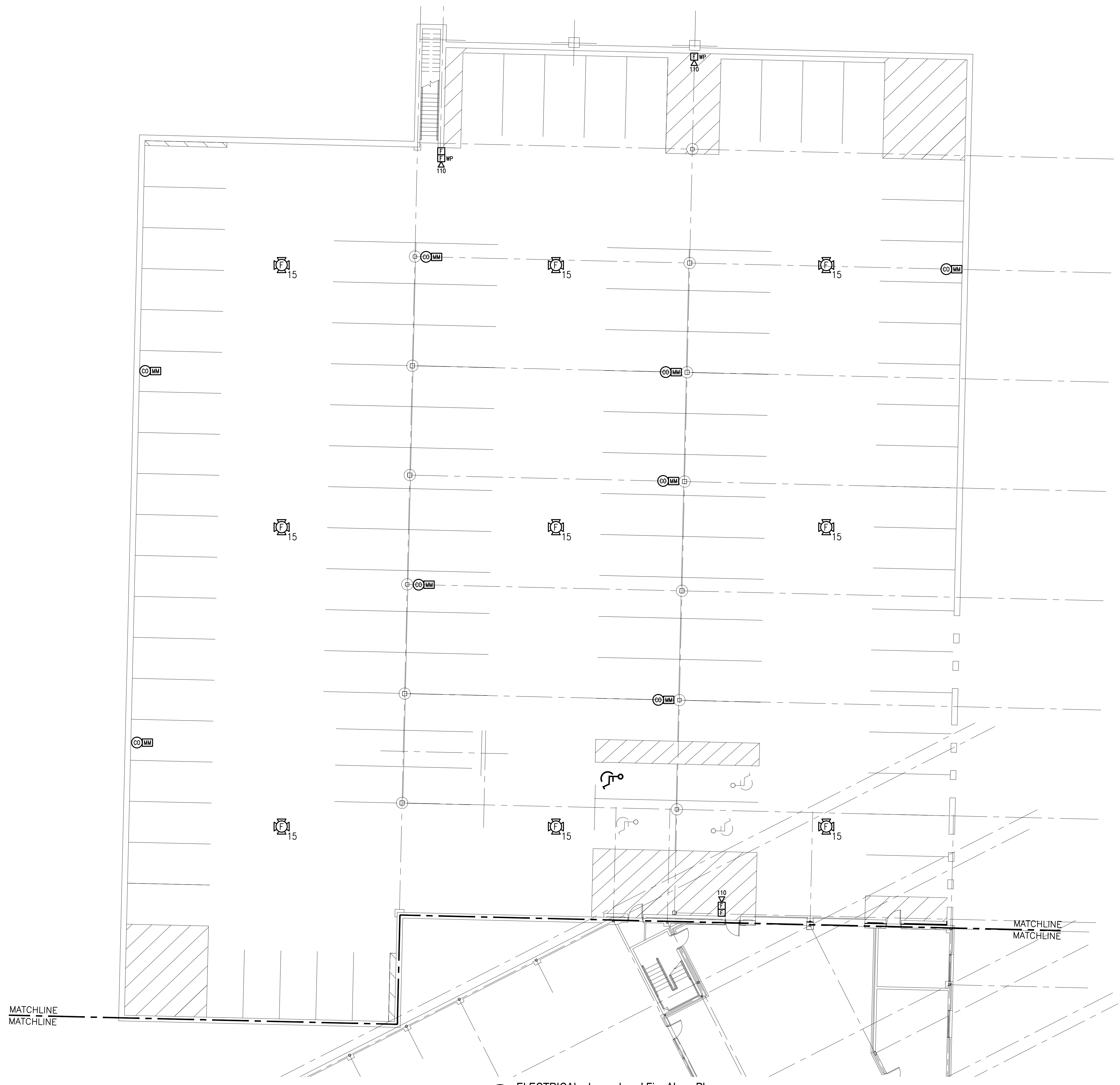
1 ELECTRICAL - Lower Level Fire Alarm Plan SCALE: 3/32" = 1'-0"