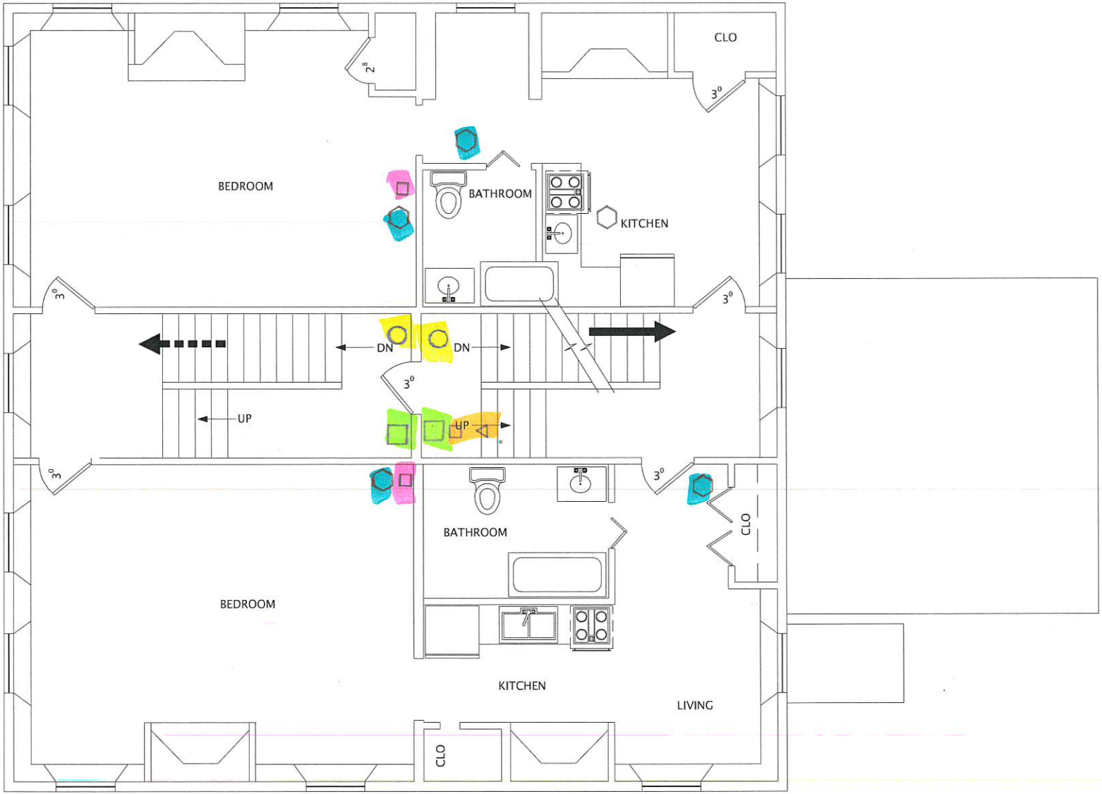
38 PLEASANT ST. 2ND FLOOR PLAN