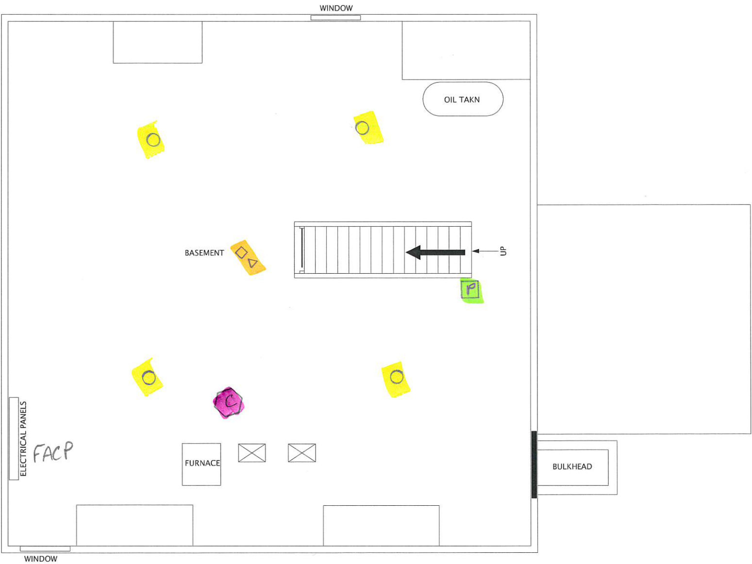
38 PLEASANT ST. BASEMENT FLOOR PLAN