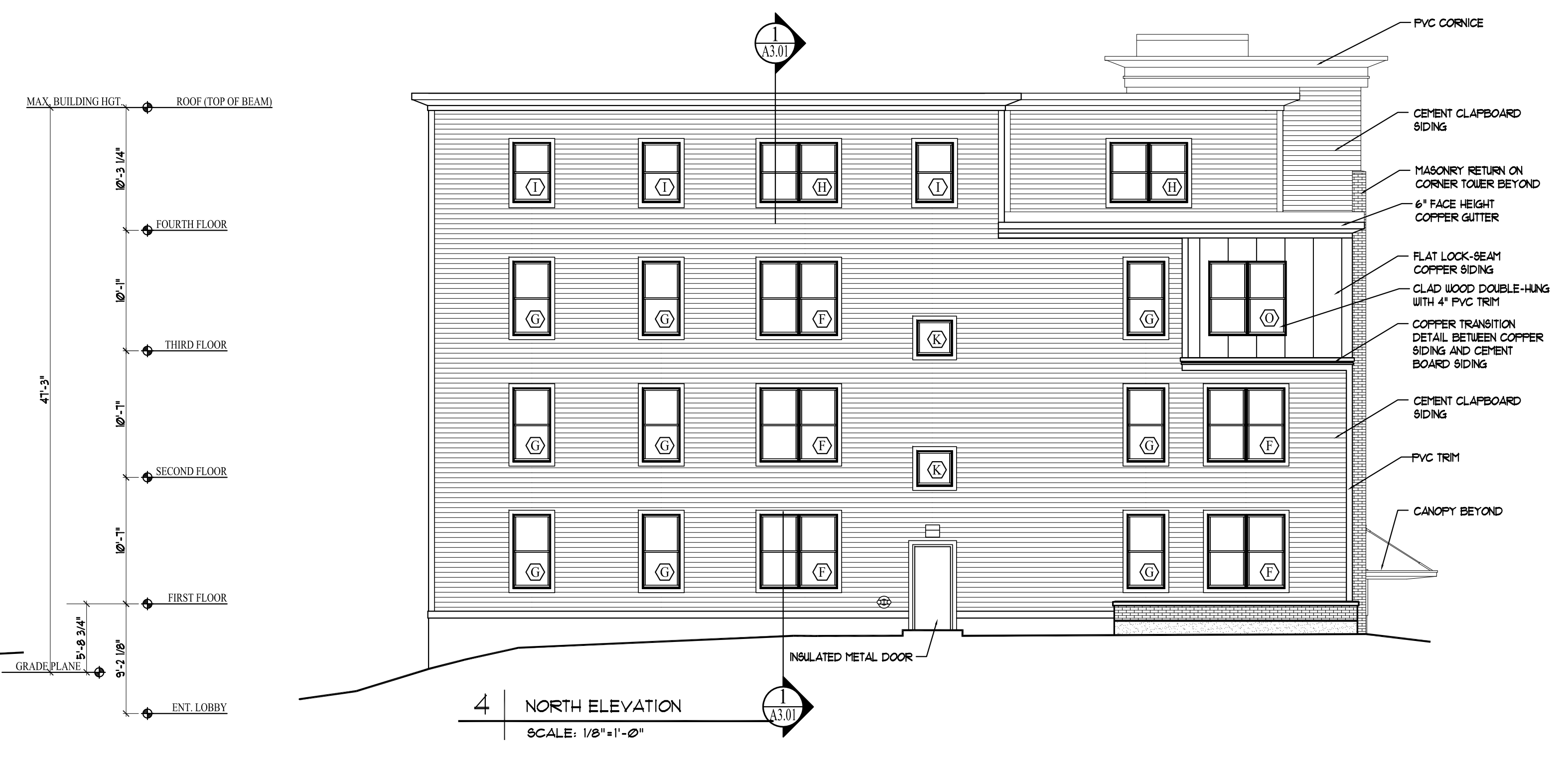
4 NORTH ELEVATION SCALE: 1/8"=1'-0"