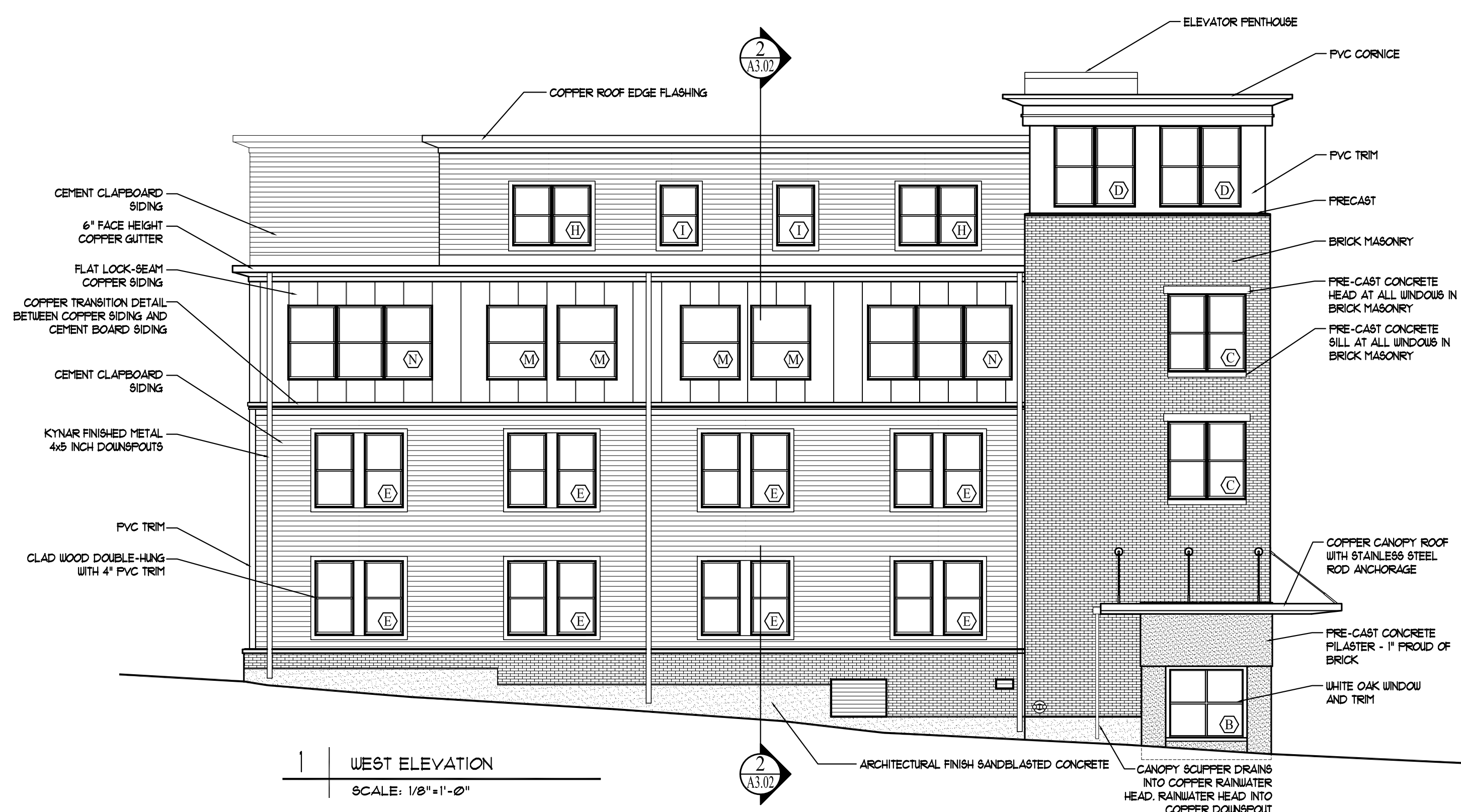
1 WEST ELEVATION SCALE: 1/8"=1'-0"