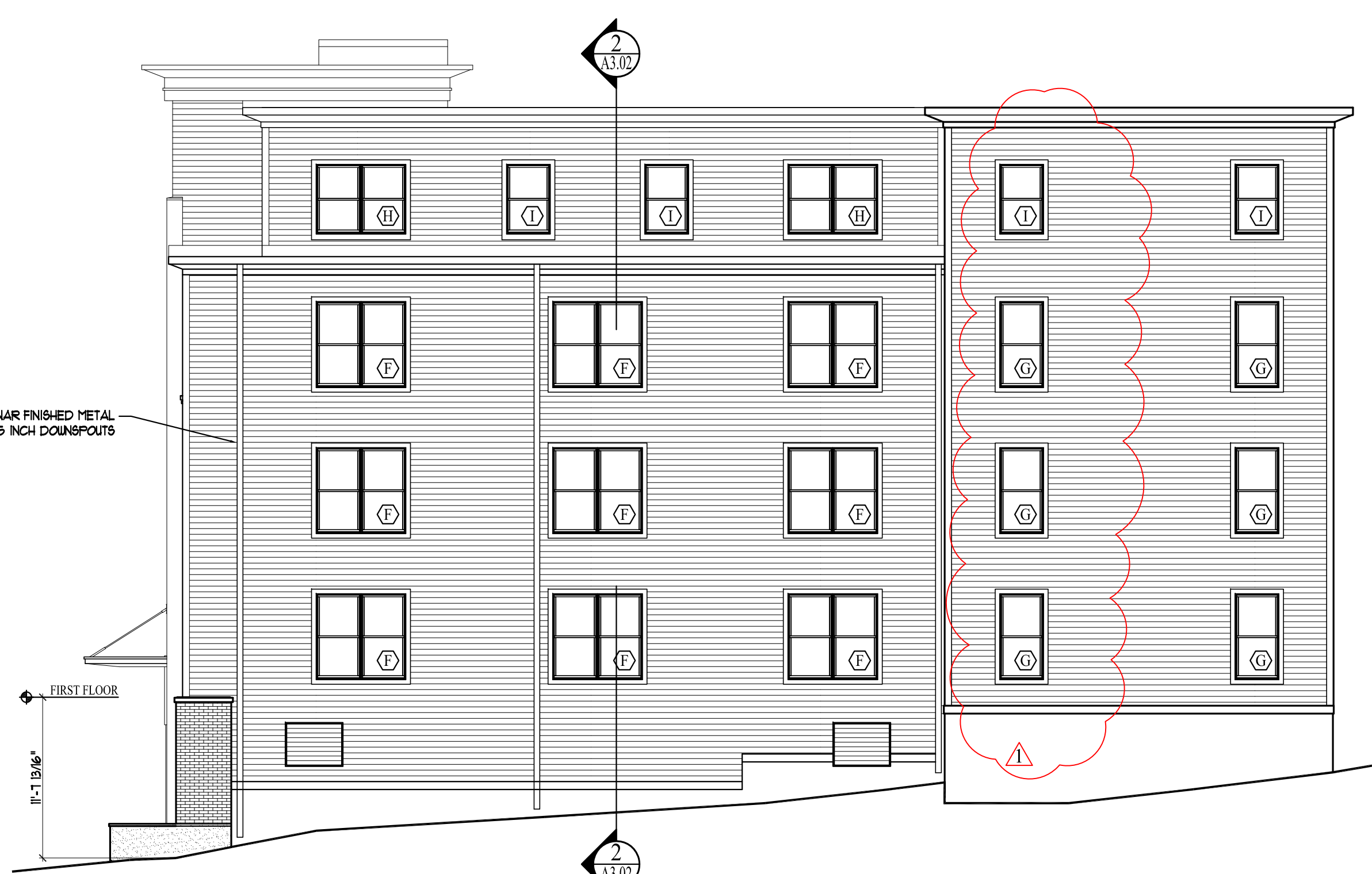
3 EAST ELEVATION SCALE: 1/8"=1'-0"