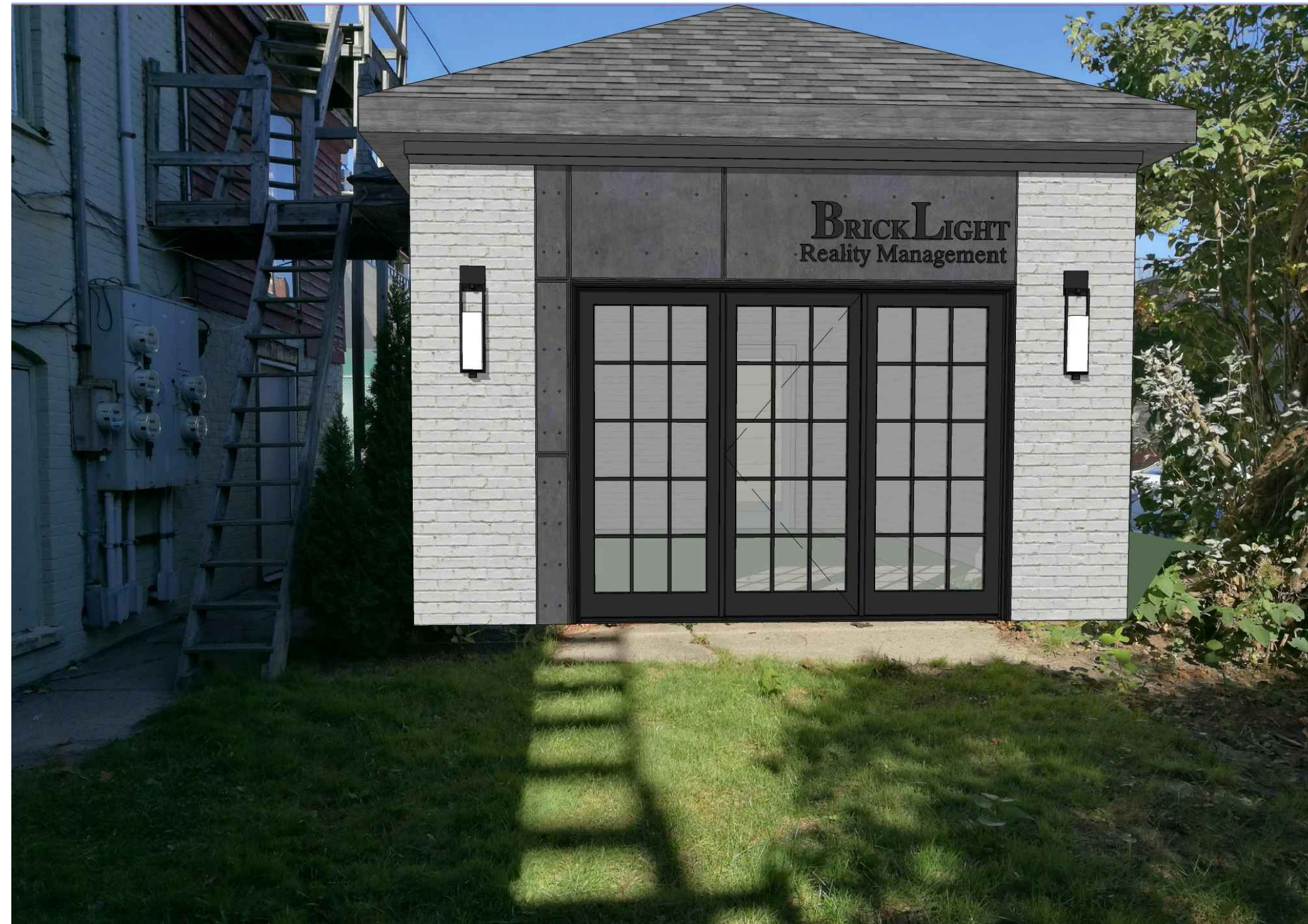
PROPOSED PROJECT VIEW