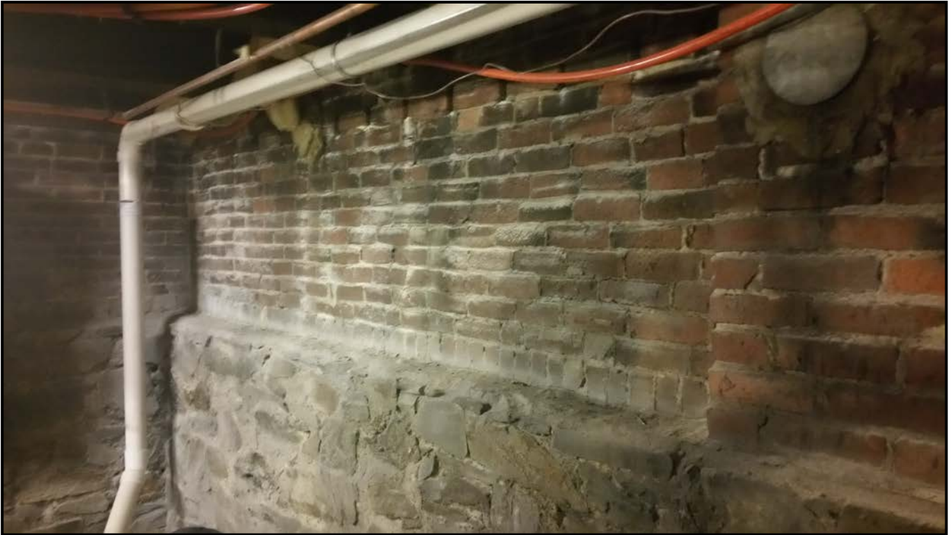
Photo 1: Image showing existing straight & level foundation wall in good condition