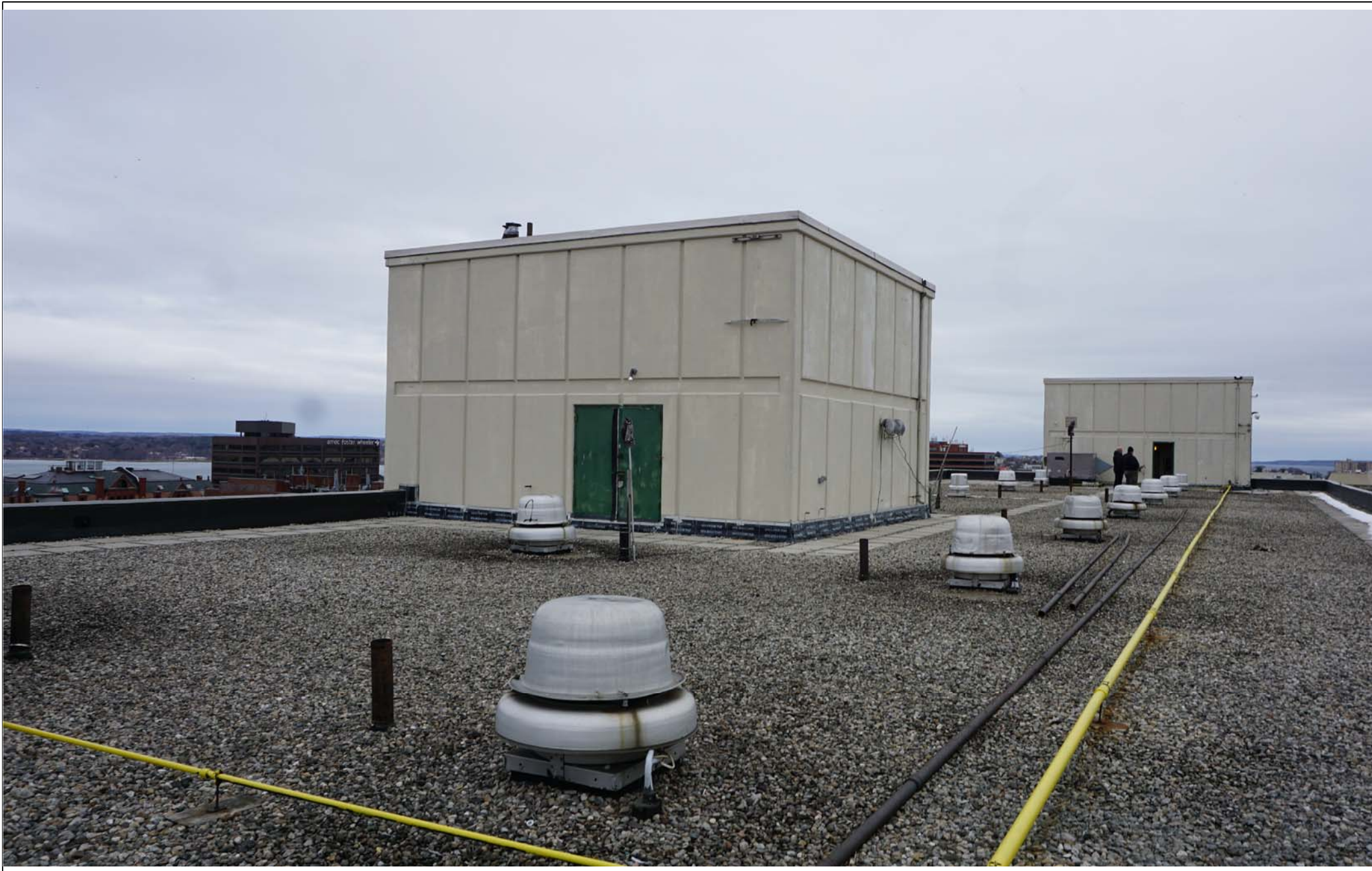
7 IMAGE ELEVATION SCALE: NTS