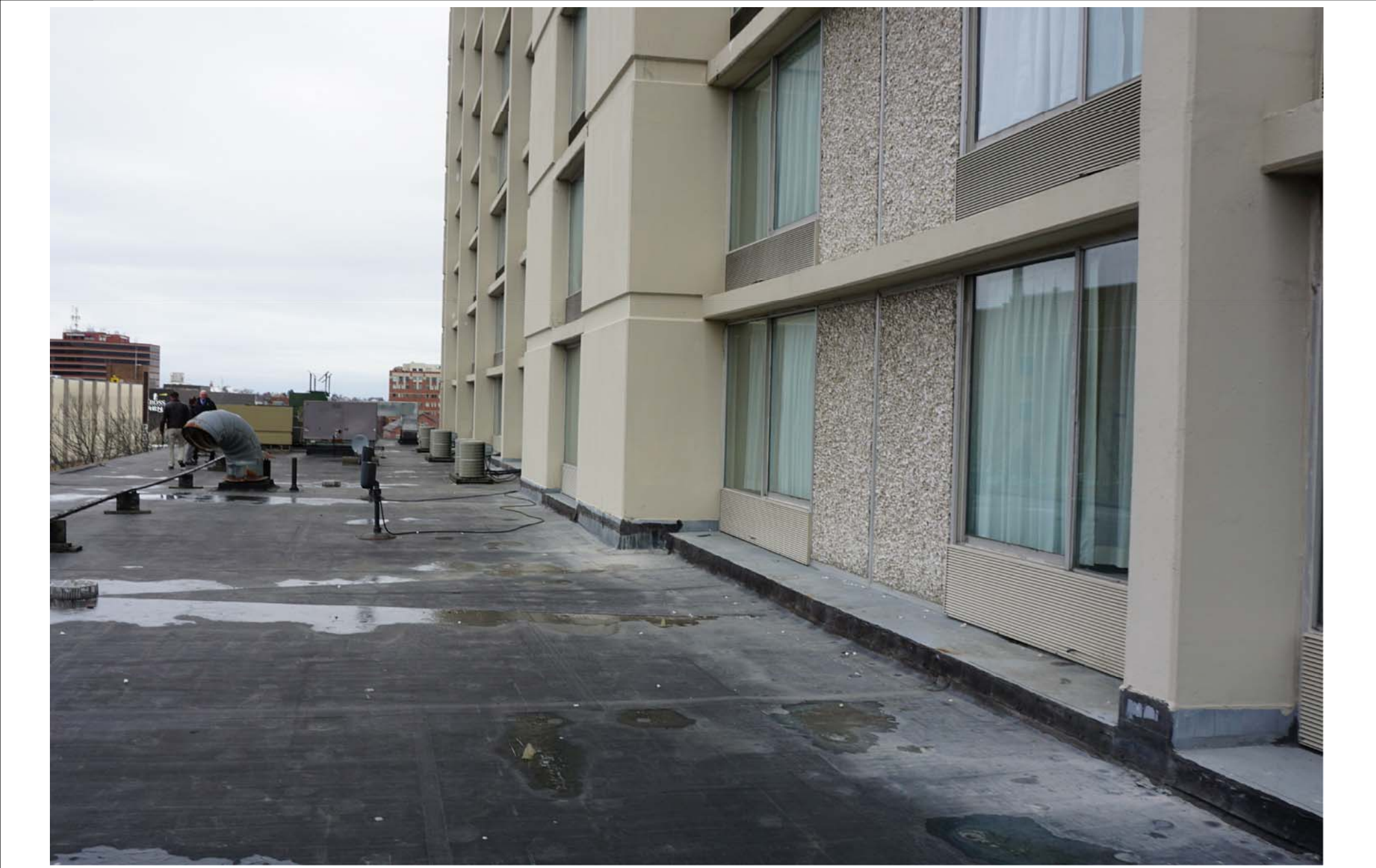
2 IMAGE ELEVATION SCALE: NTS