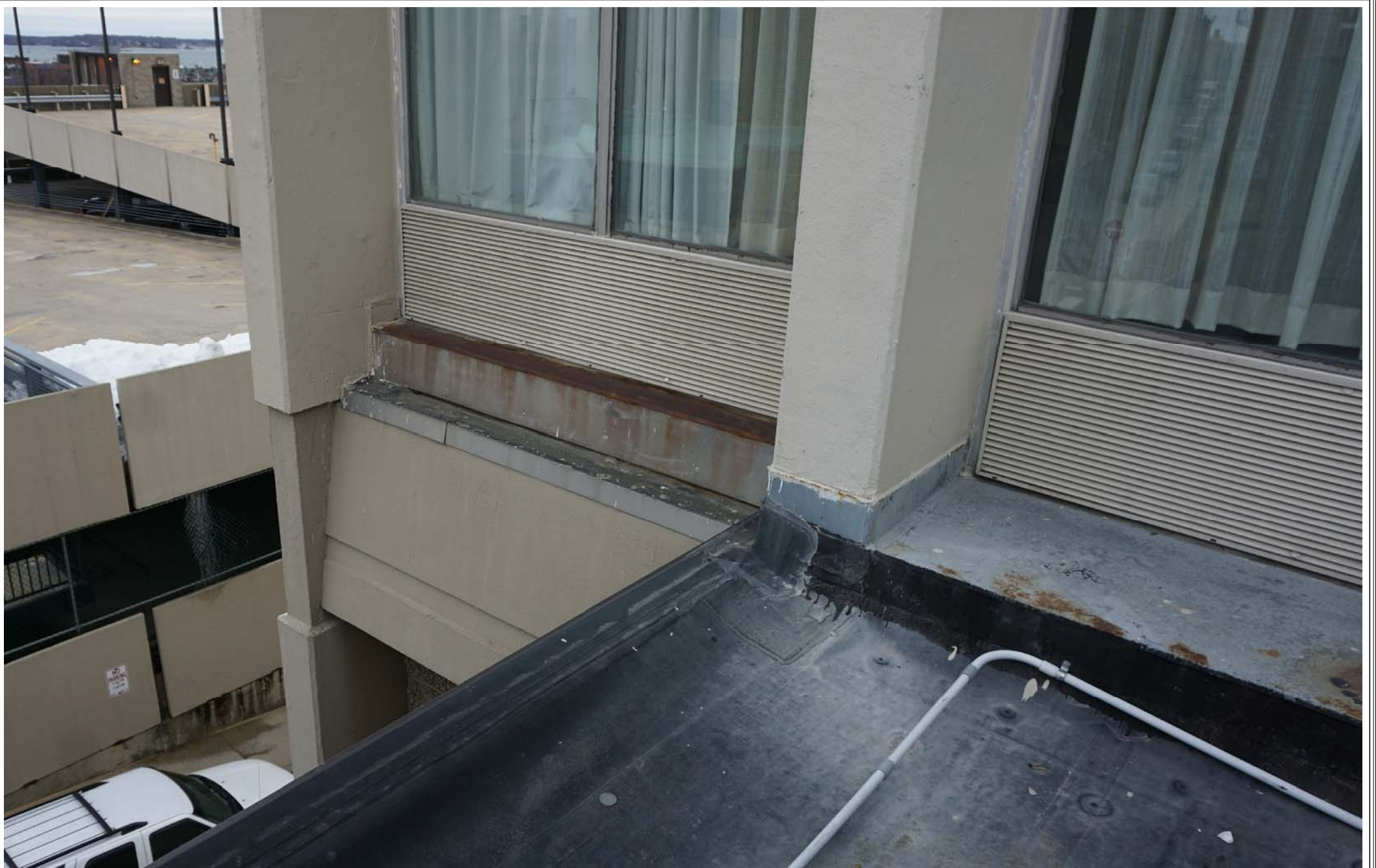
3 IMAGE ELEVATION SCALE: NTS

Prepared For: LAFAYETTE PROPERTIES, LLC 155 LITTLEFIELD STREET BANGOR, MAINE 04401