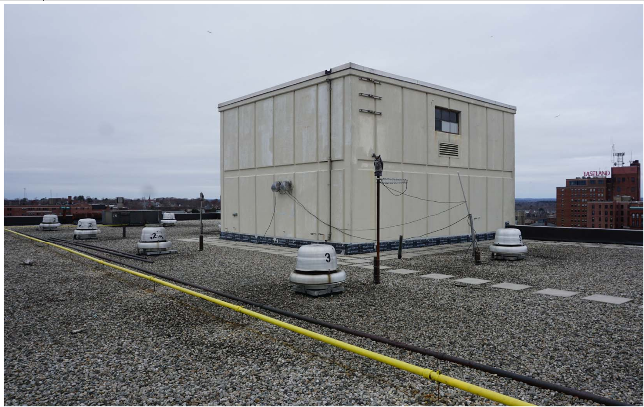
5 IMAGE ELEVATION SCALE: NTS