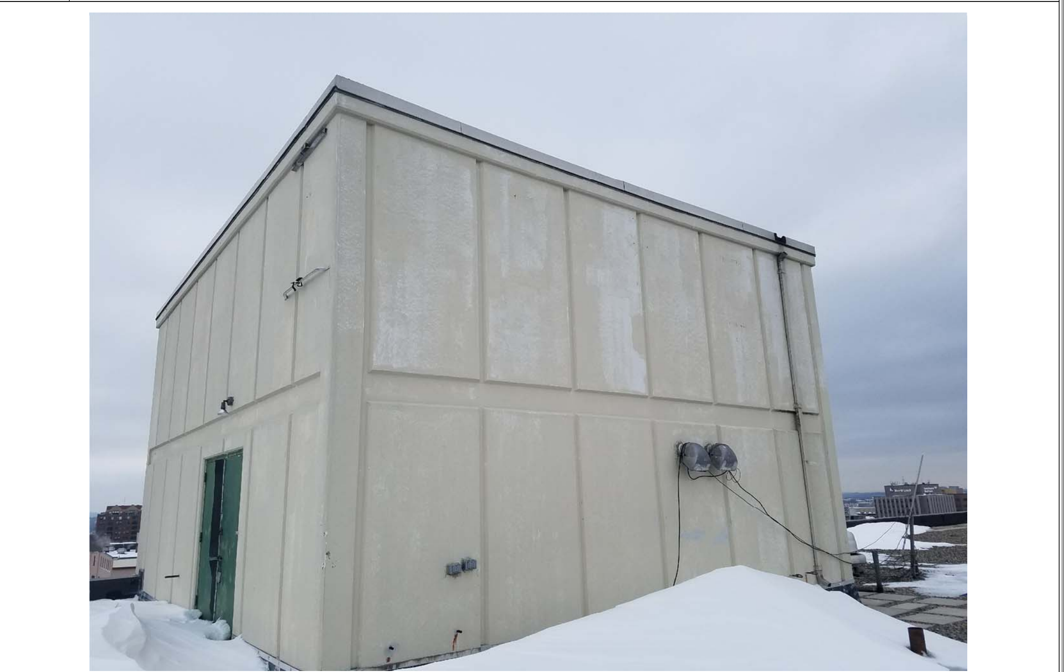
6 IMAGE ELEVATION SCALE: NTS