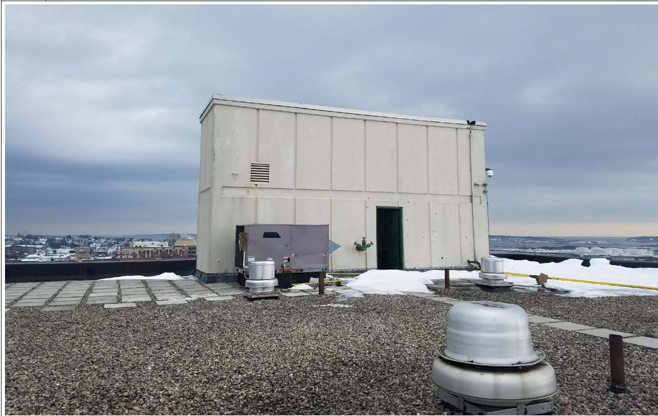
4 IMAGE ELEVATION SCALE: NTS