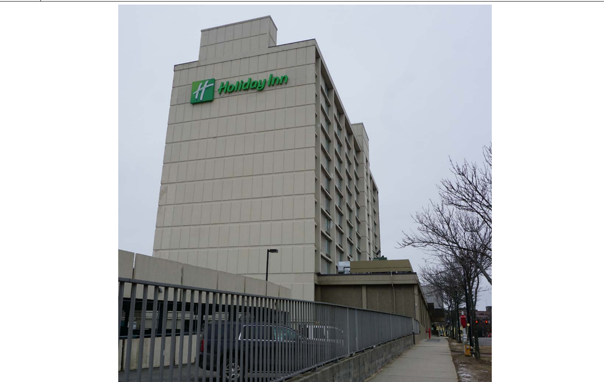
1 IMAGE ELEVATION SCALE: NTS