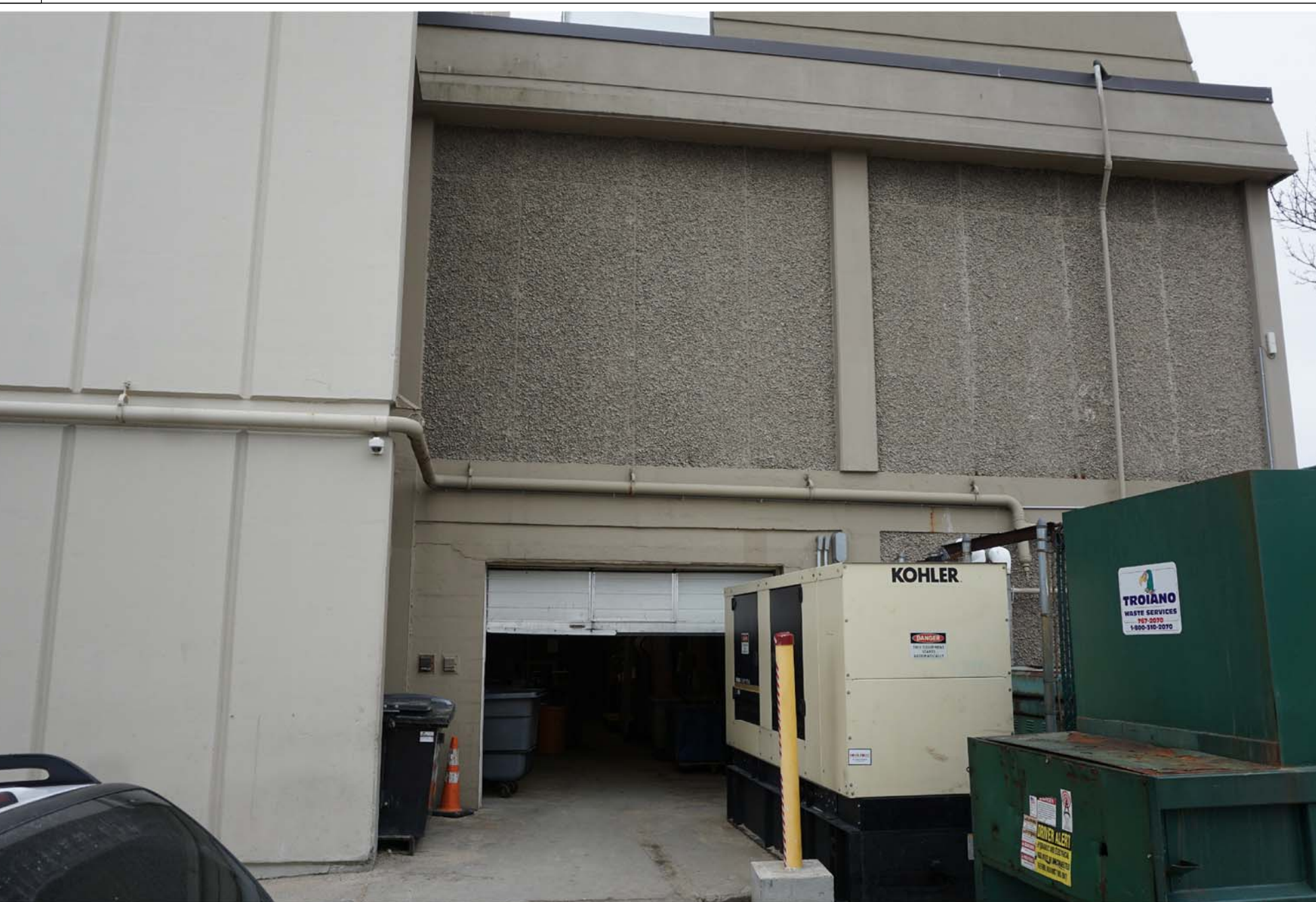
3 IMAGE ELEVATION SCALE: NTS

Prepared For: LAFAYETTE PROPERTIES, LLC 155 LITTLEFIELD STREET BANGOR, MAINE 04401