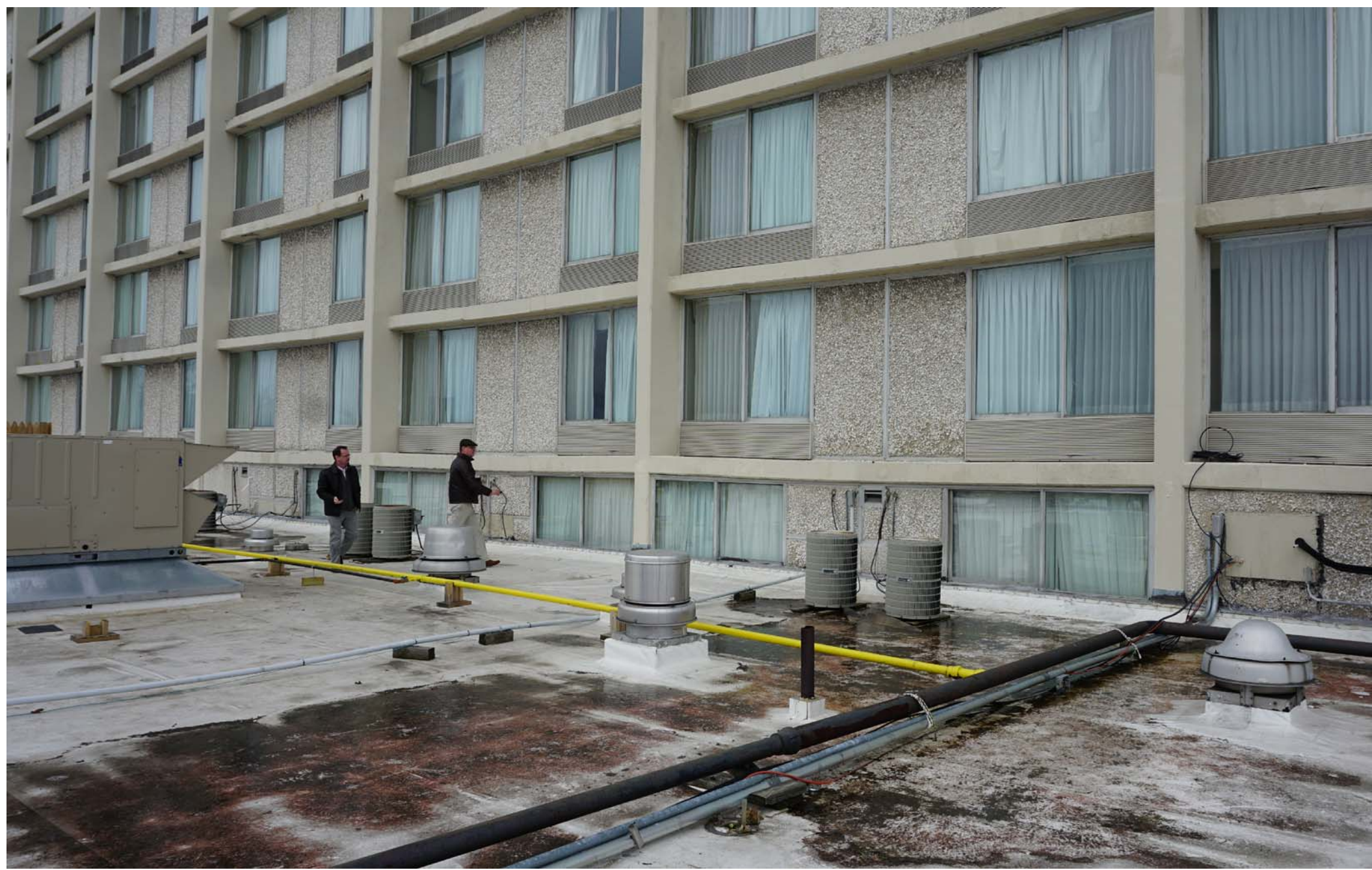
7 IMAGE ELEVATION SCALE: NTS