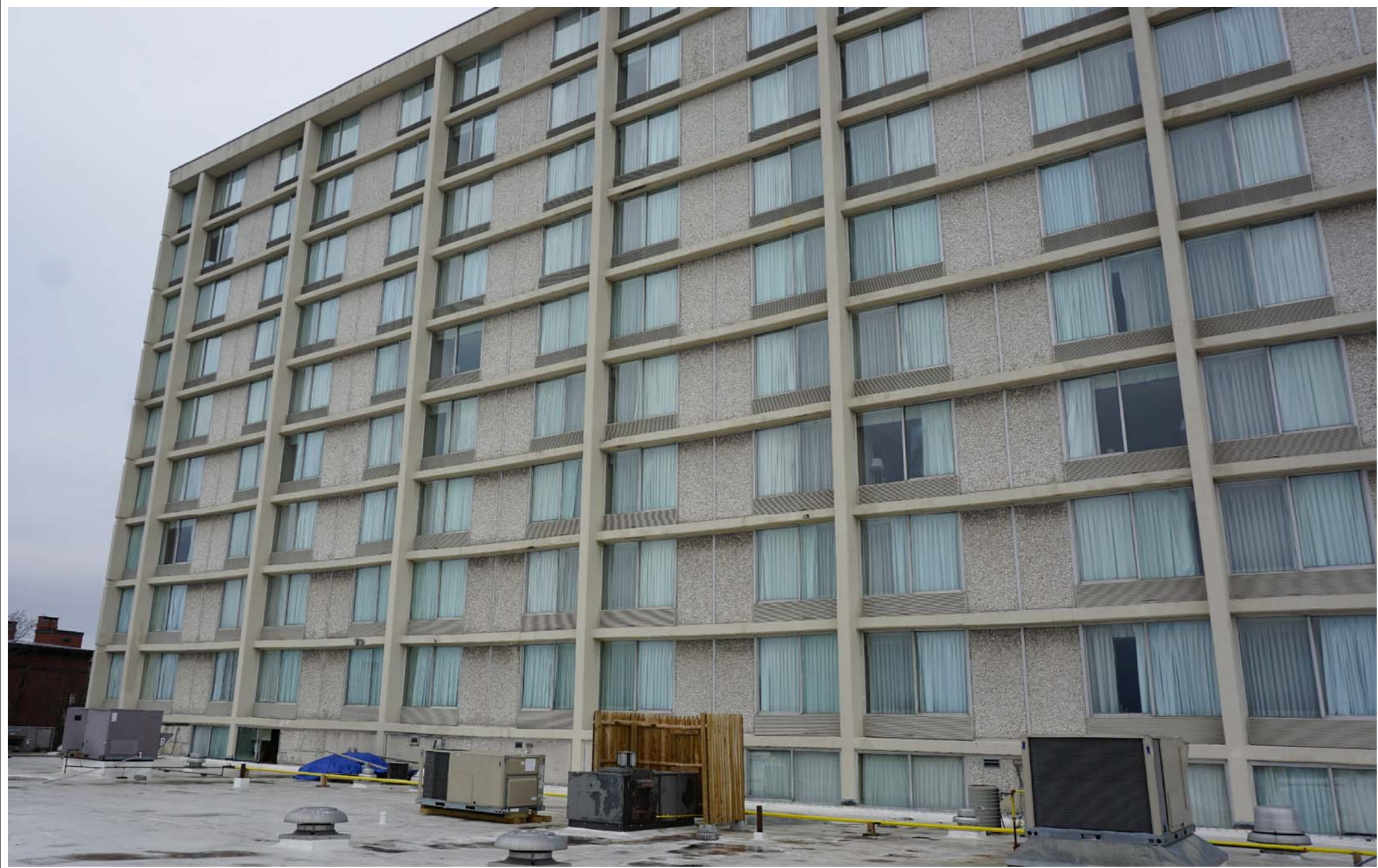
8 IMAGE ELEVATION SCALE: NTS