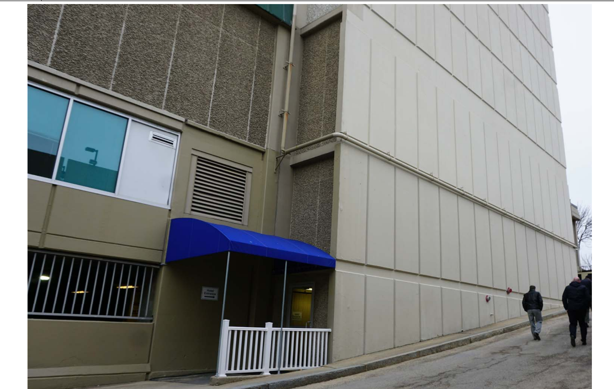
4 IMAGE ELEVATION SCALE: NTS