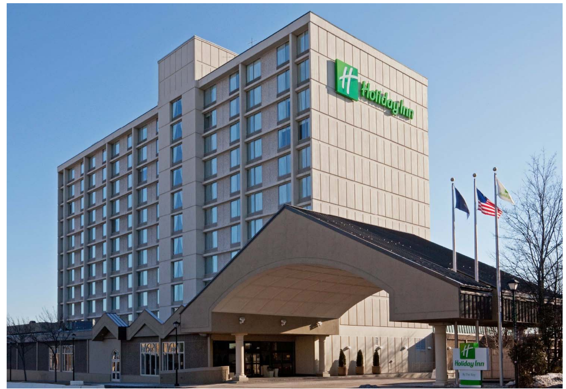
9 IMAGE ELEVATION SCALE: NTS