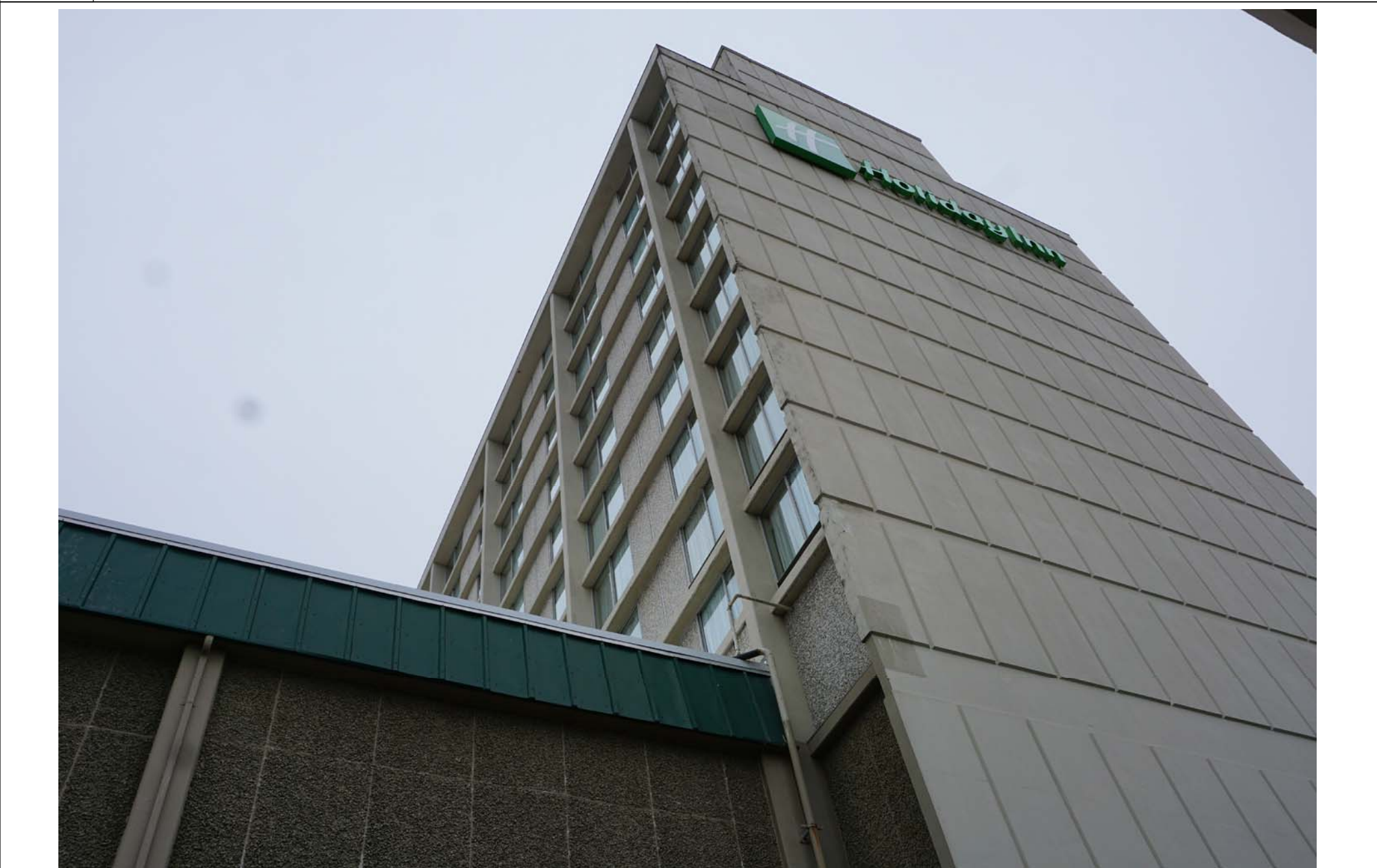
5 IMAGE ELEVATION SCALE: NTS