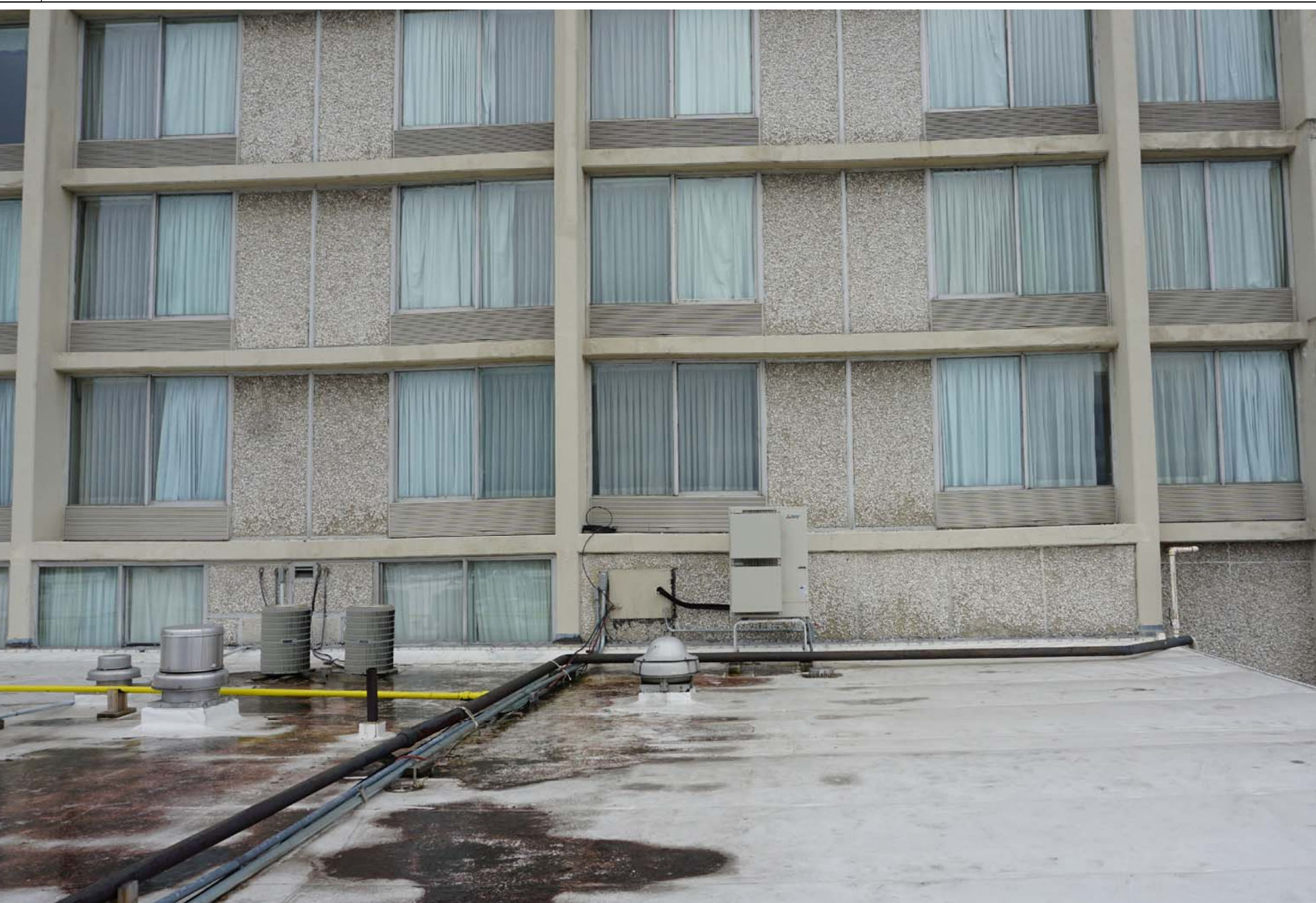
6 IMAGE ELEVATION SCALE: NTS