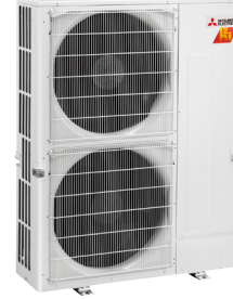
Outdoor Unit: MXZ-8C48NAHZ

(For data on specific indoor units, see the MXZ-C Technical and Service Manual.)