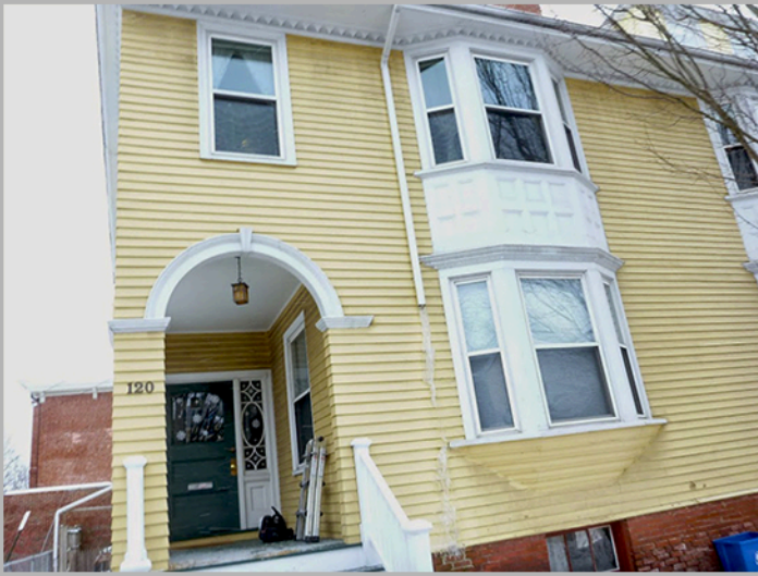
Existing Location Photos