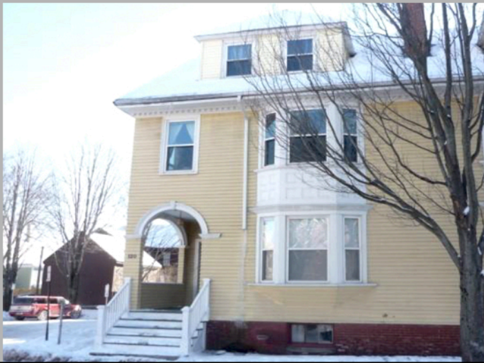
Existing Location Photos