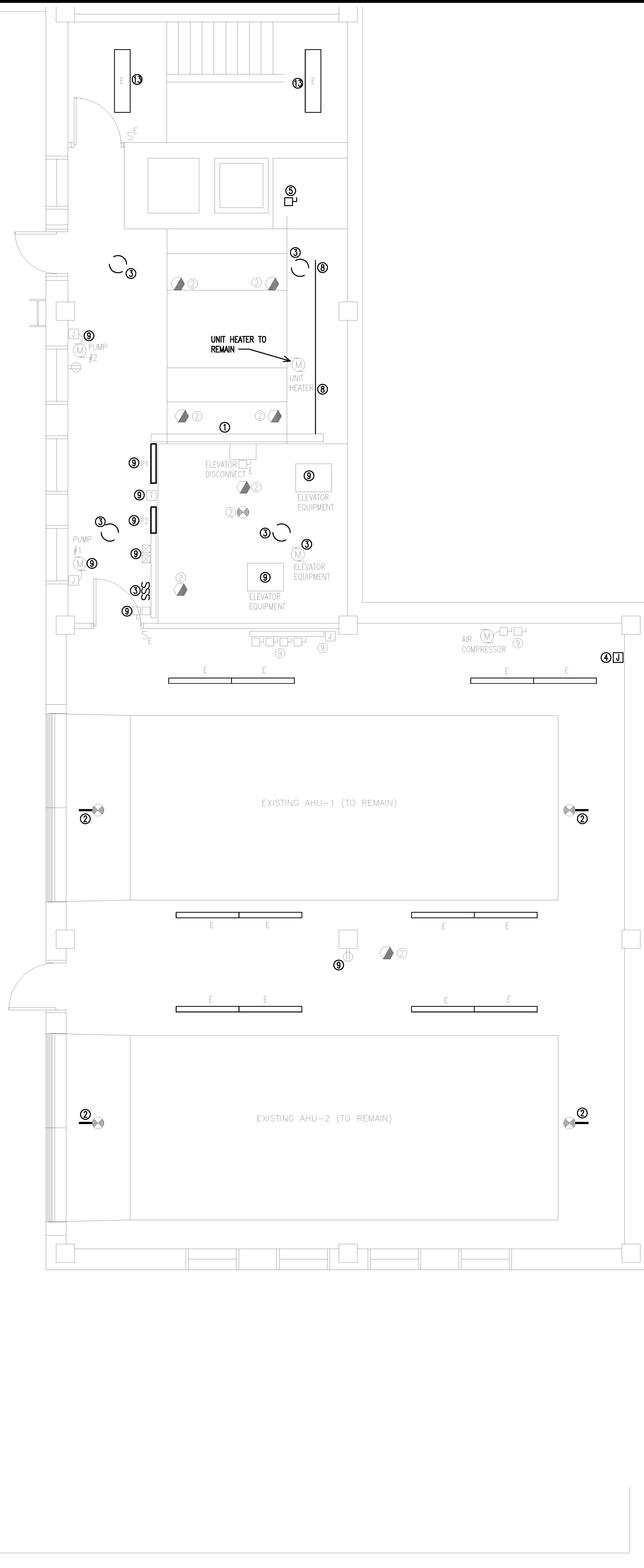
PENTHOUSE 4th FLOOR Scale: 1/4" = 1'-0"