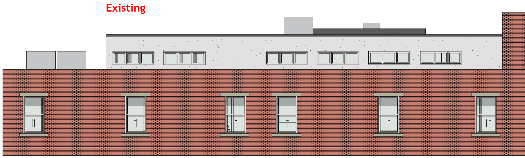
South Elev Parking Lot Side SCALE: 1/8" = 1'-0"

CALEB JOHNSON ARCHITECTS - BUILDERS 265 MAIN STREET, SUITE 201 BIDDEFORD, ME 04005 T: 207.283.8777 F: 207.283.8778 CJAB.ME