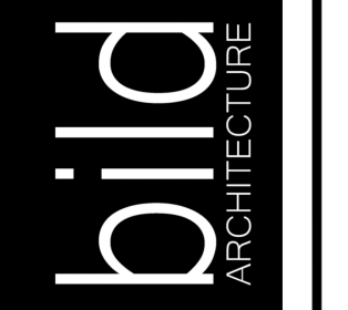
Bild Architecture PO Box 8235 Portland, ME 04104 207.408.0168 evan@bildarchitecture.com