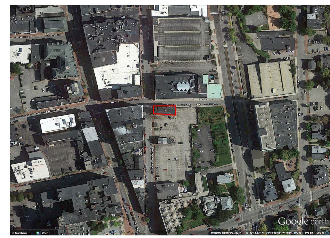
3 Site SCALE: 1" = 200'

CALEB JOHNSON ARCHITECTS + BUILDERS 265 MAIN STREET SUITE 201, BIDDEFORD, ME 04005 T: 207.283.8777 F: 207.283.8778 C: JAB:ME