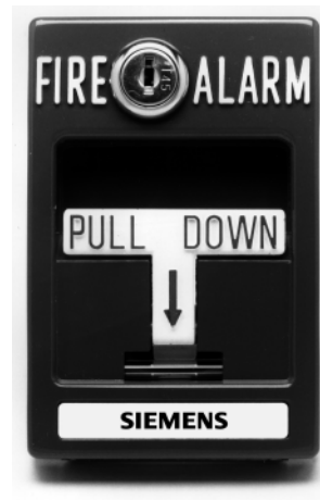
Standard Model Or Weatherproof