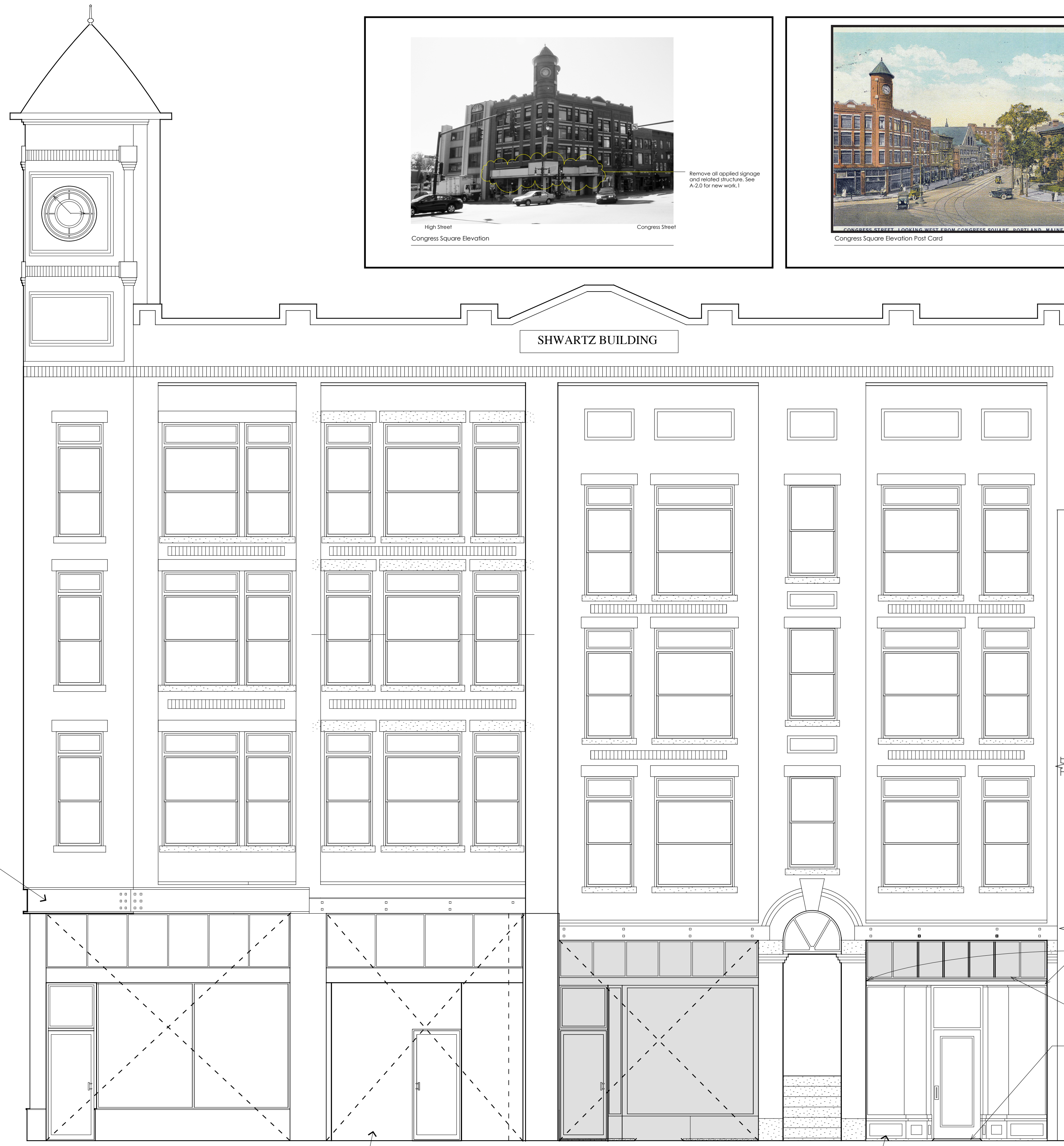
CONGRESS STREET ELEVATION