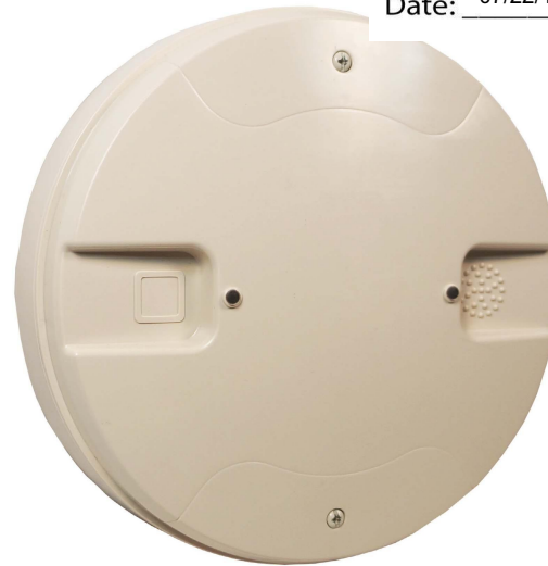
W-GATE Wireless System Gateway