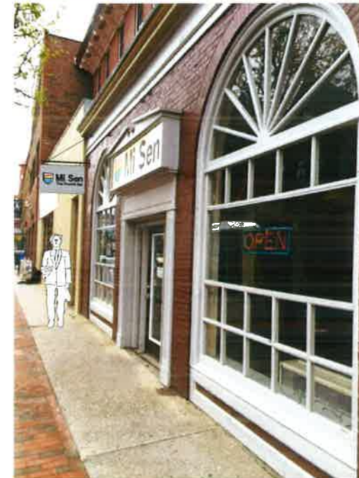
PHOTO COMPOSITE NO SCALE