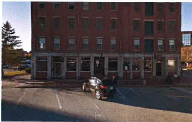
269 Commercial St Portland, ME 04101