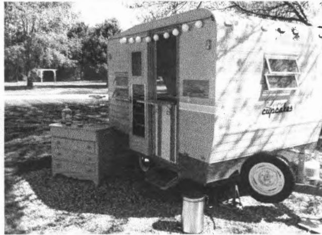
May 12, 2012 - Trailer on loose rocks (9' wide x 11' long)

Trailer Dimensions: L = 10'5" W = 7'6" H = 9'