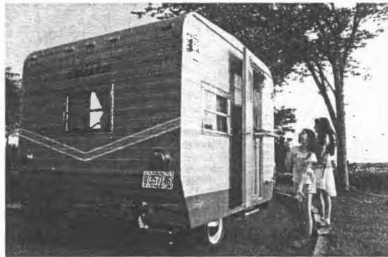
Rear/Service Side View