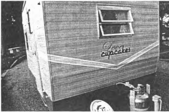
Front View (Tounge and Spare)