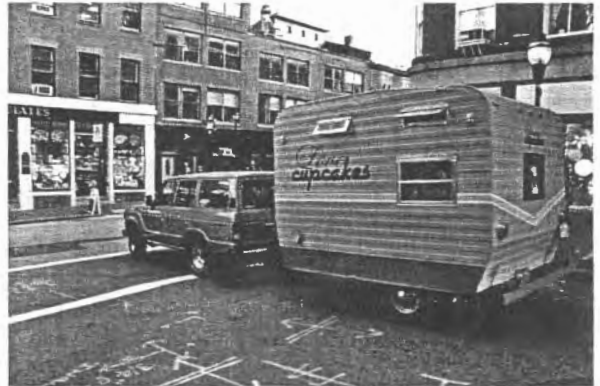
Power and Waste Water Side (Driving)