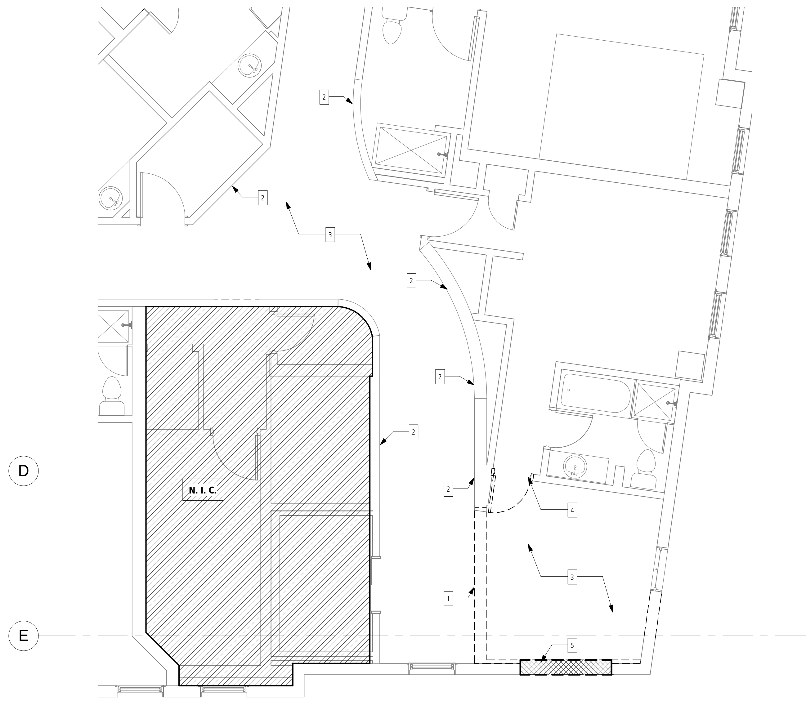
3 Level 2 DEMO Plan - Callout 1 1/4" = 1'-0"