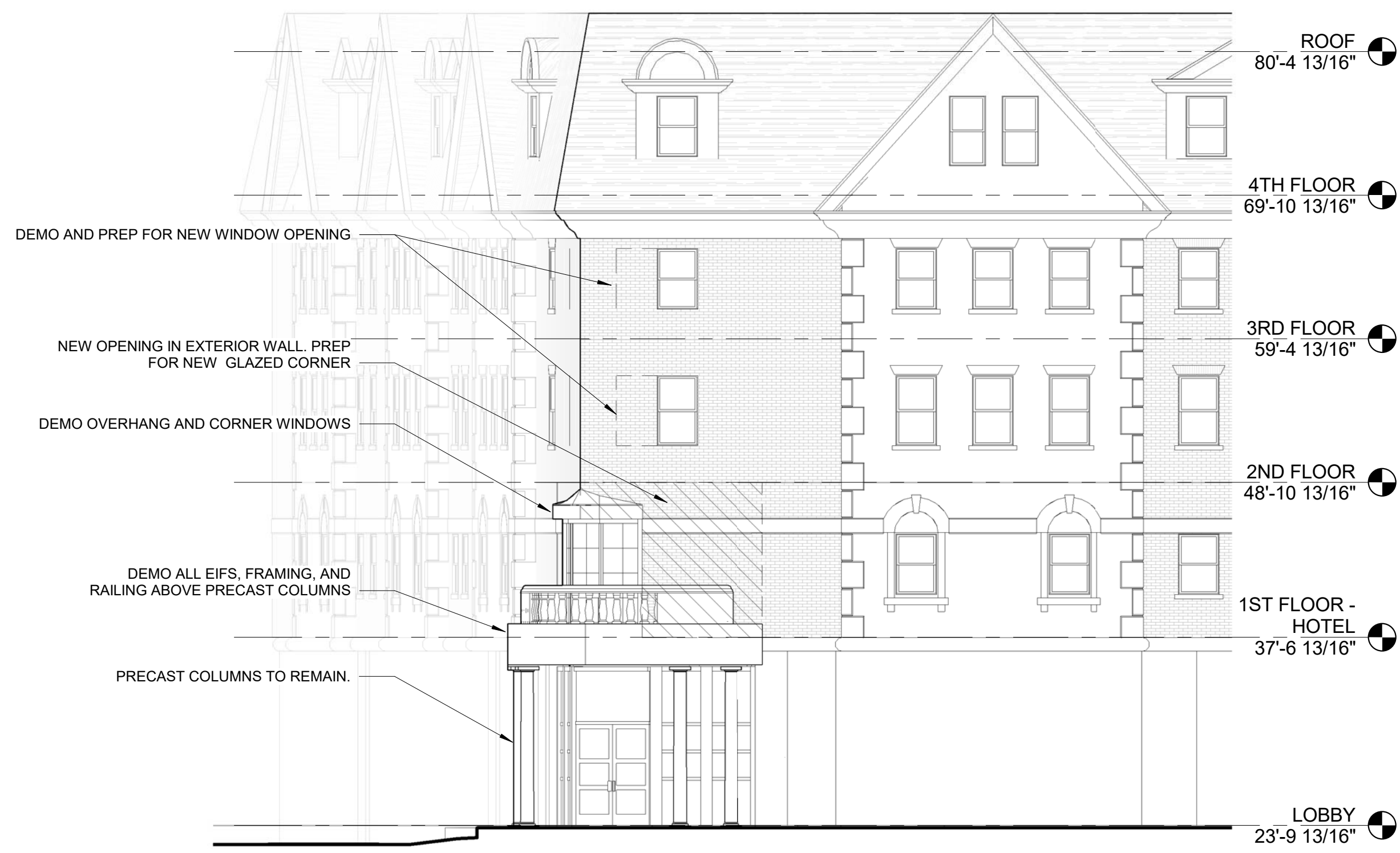
3 | EXISTING FORE STREET ELEVATION 1/8" = 1'-0"