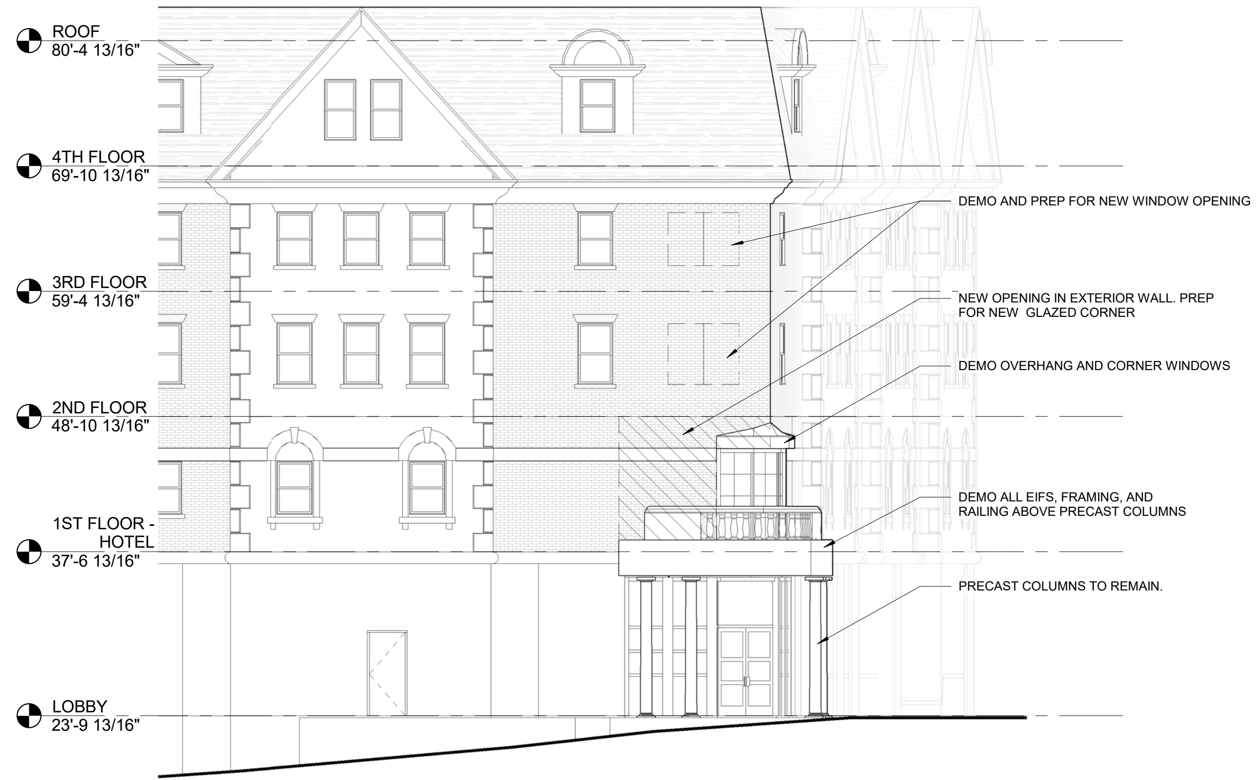
4 | EXISTING UNION STREET ELEVATION 1/8" = 1'-0"