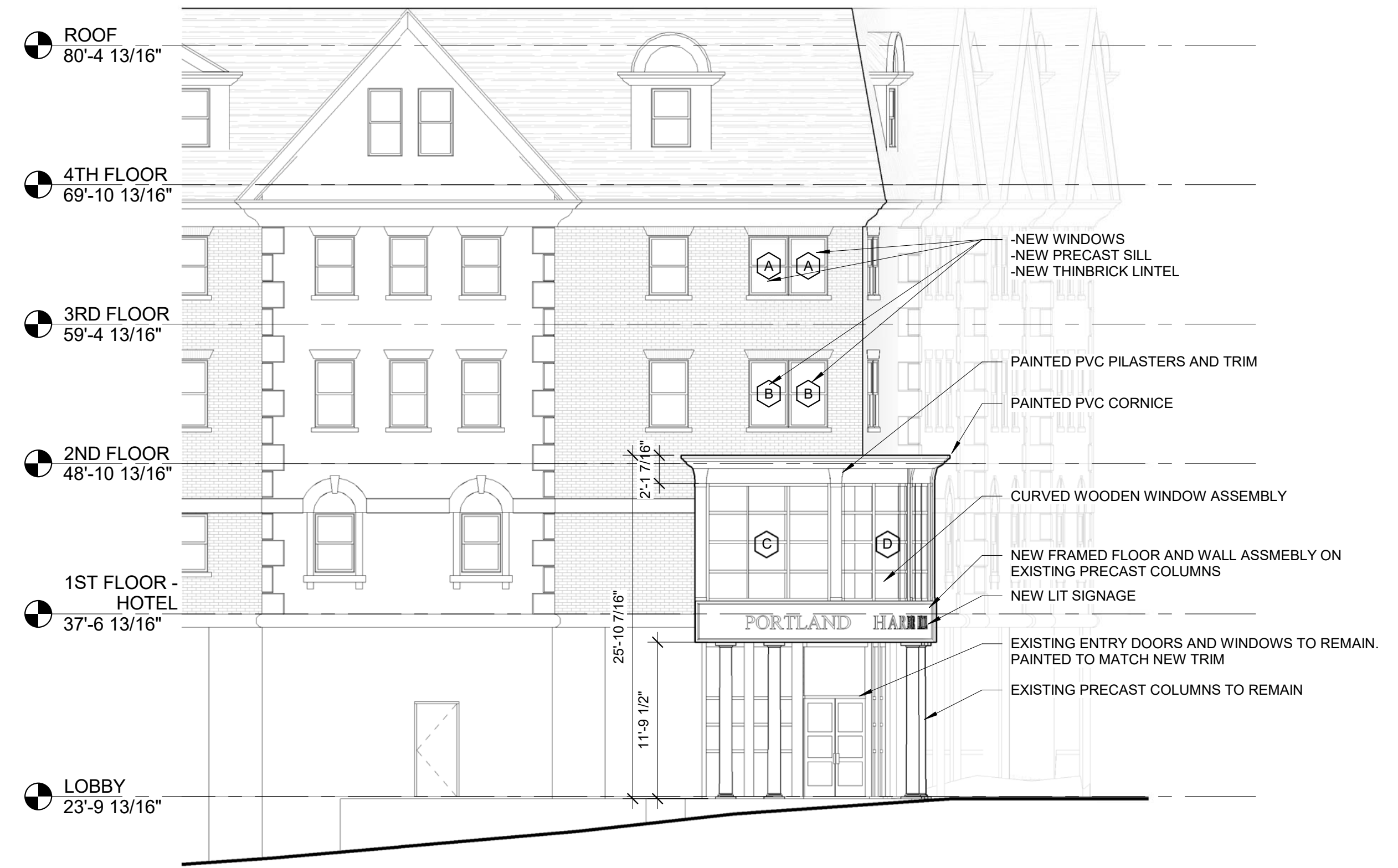
2 | PROPOSED UNION STREET ELEVATION 1/8" = 1'-0"