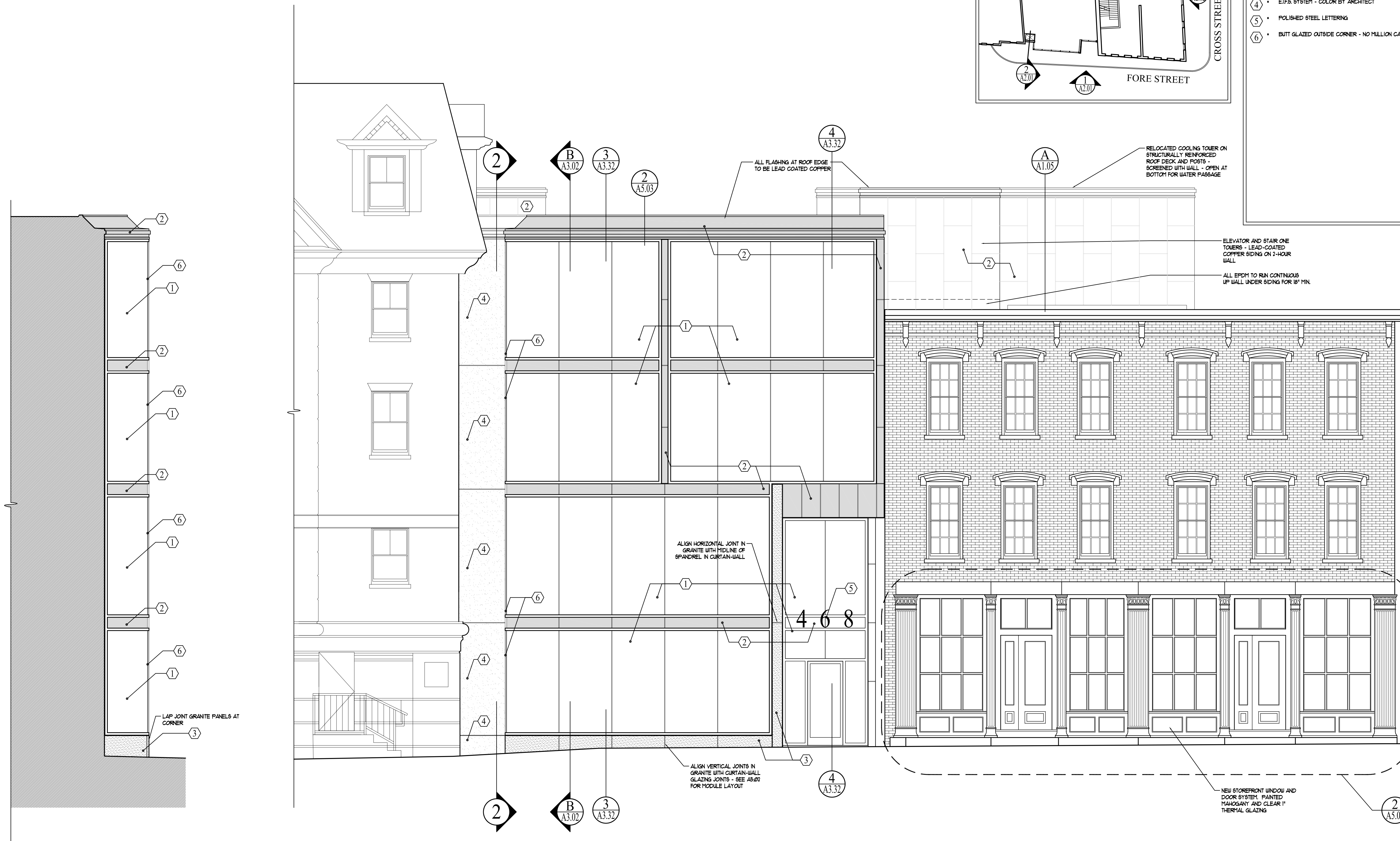
2 | PARTIAL ELEVATION - EAST SCALE: 1/4"=1'-0"