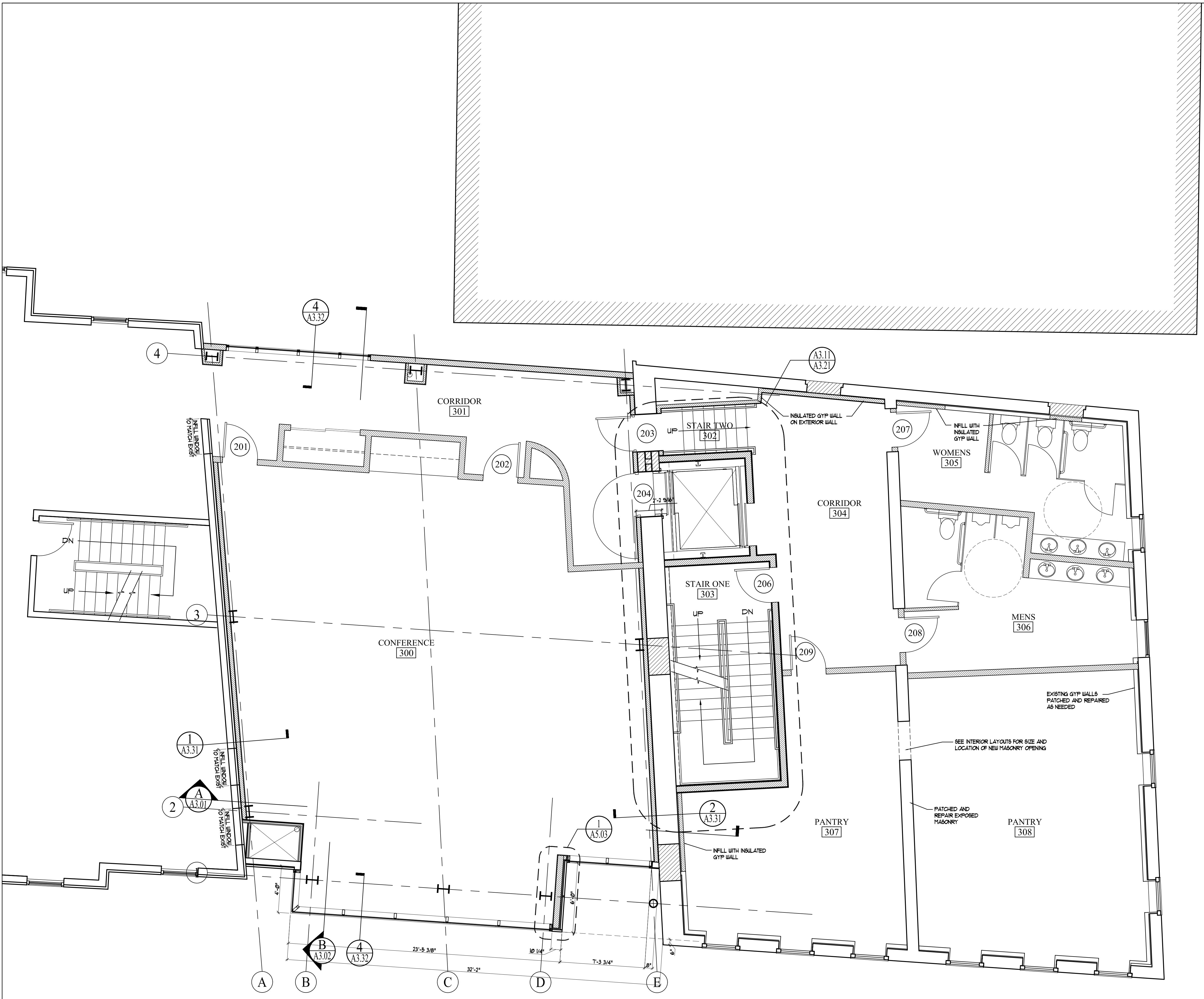
3 FIRST FLOOR PLAN SCALE: 1/4"=1'-0"