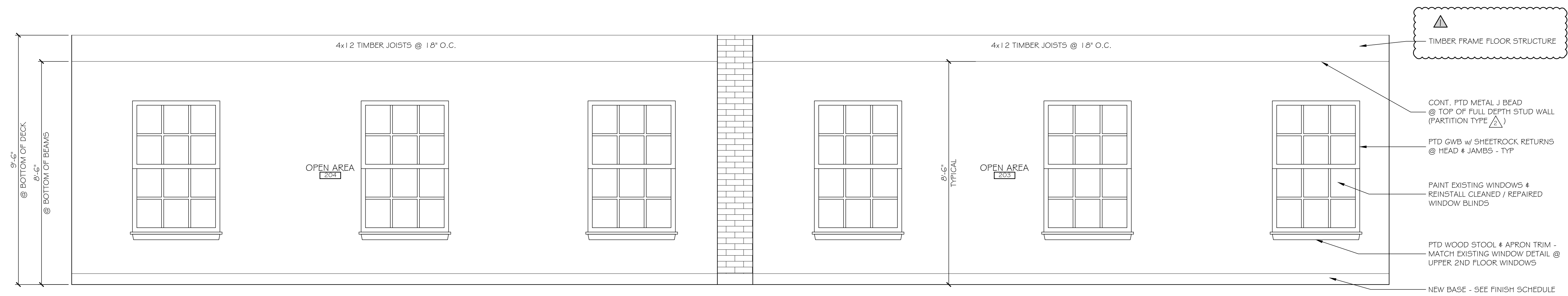
① COMMERCIAL STREET INTERIOR ELEVATION SCALE: 1/4" = 1'-0"

COPYRIGHT REPRODUCTION OR REV. OF THIS DOCUMENT WITHOUT WRITTEN PERMISSION FROM GRANT HAYS ASSOCIATES IS PROHIBITED.