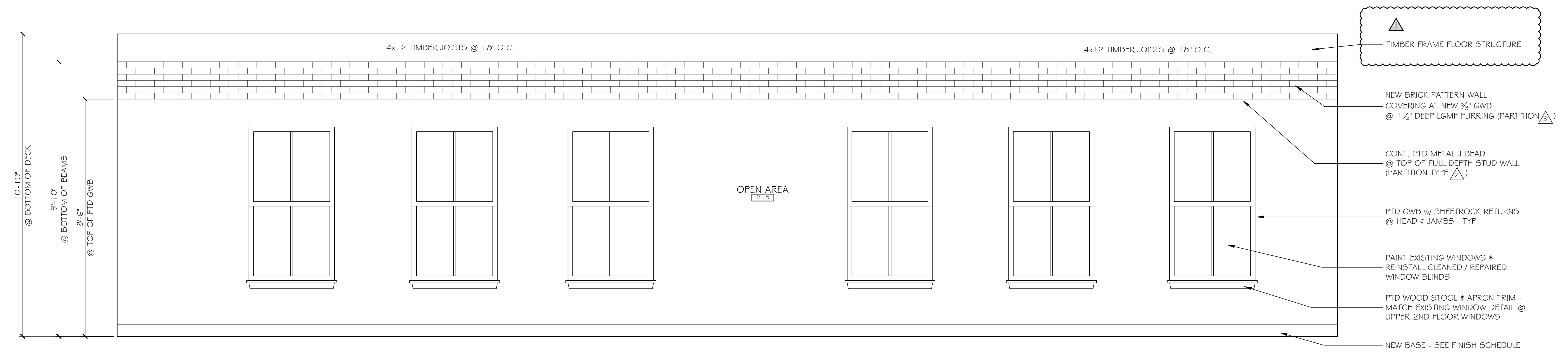
② COMMERCIAL STREET INTERIOR ELEVATION SCALE: 1/4" = 1'-0"