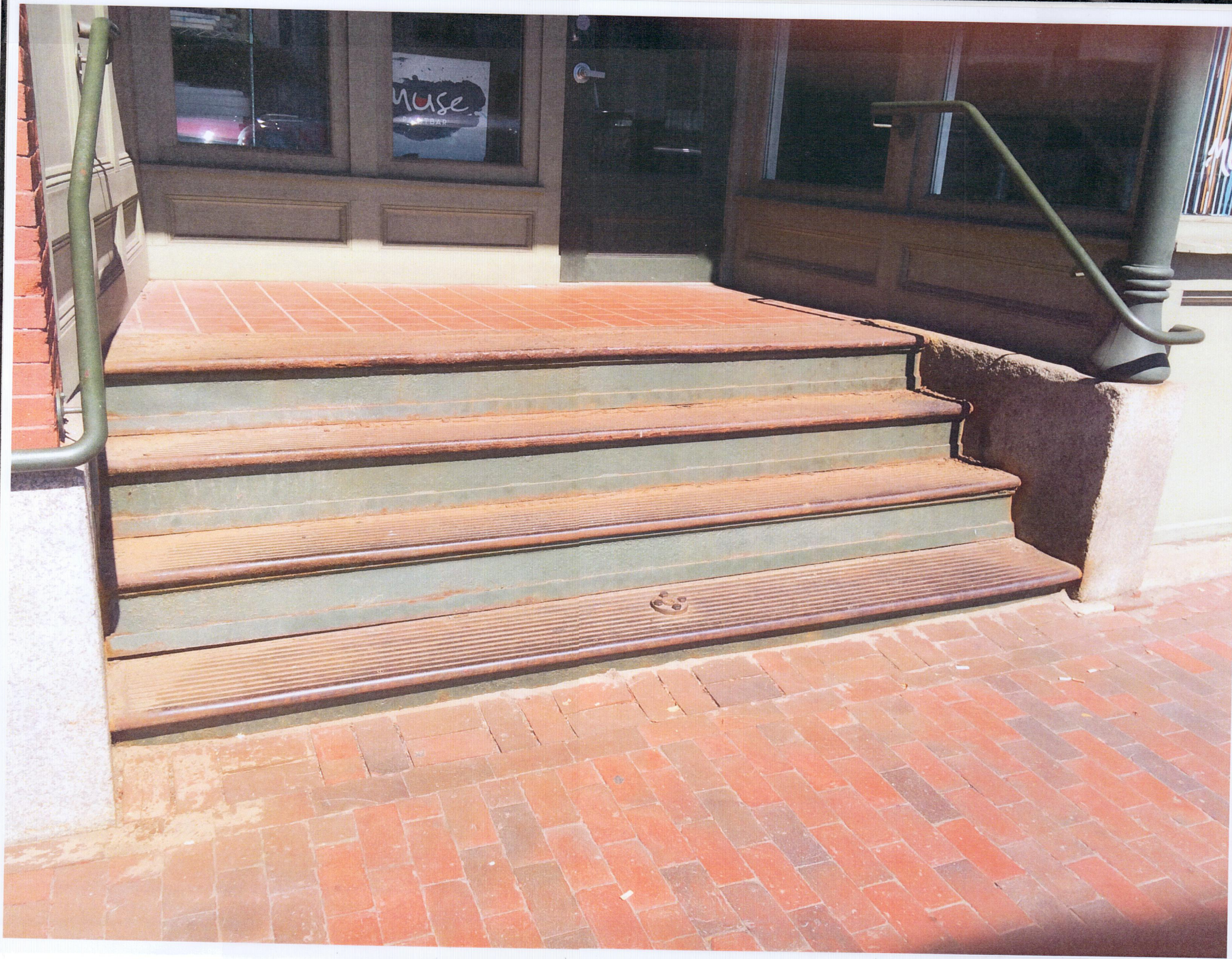
A - EXISTING STEPS AT 241 COMMERCIAL ST