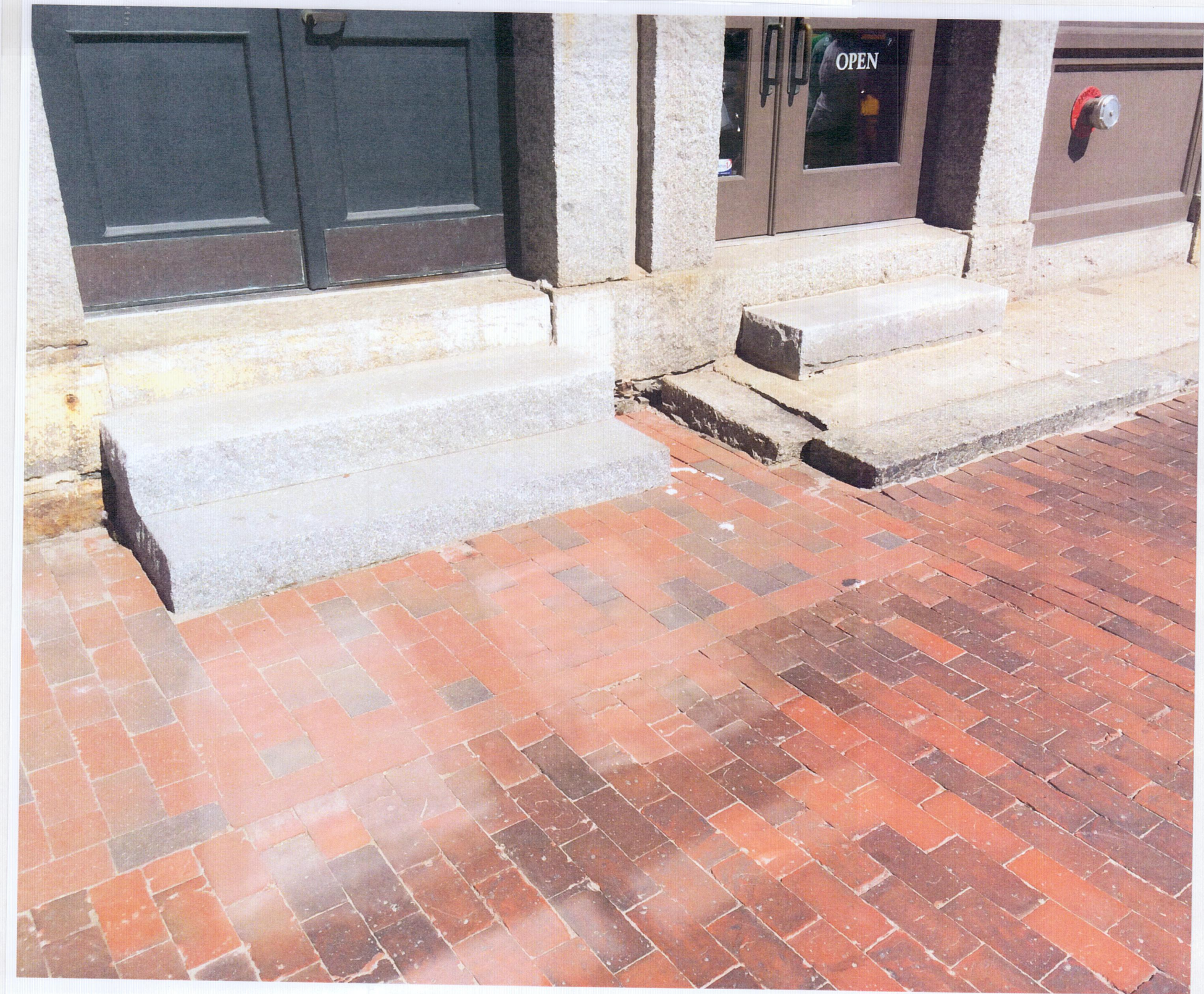
EXAMPLE - STEPS AT COMMERCIAL ST