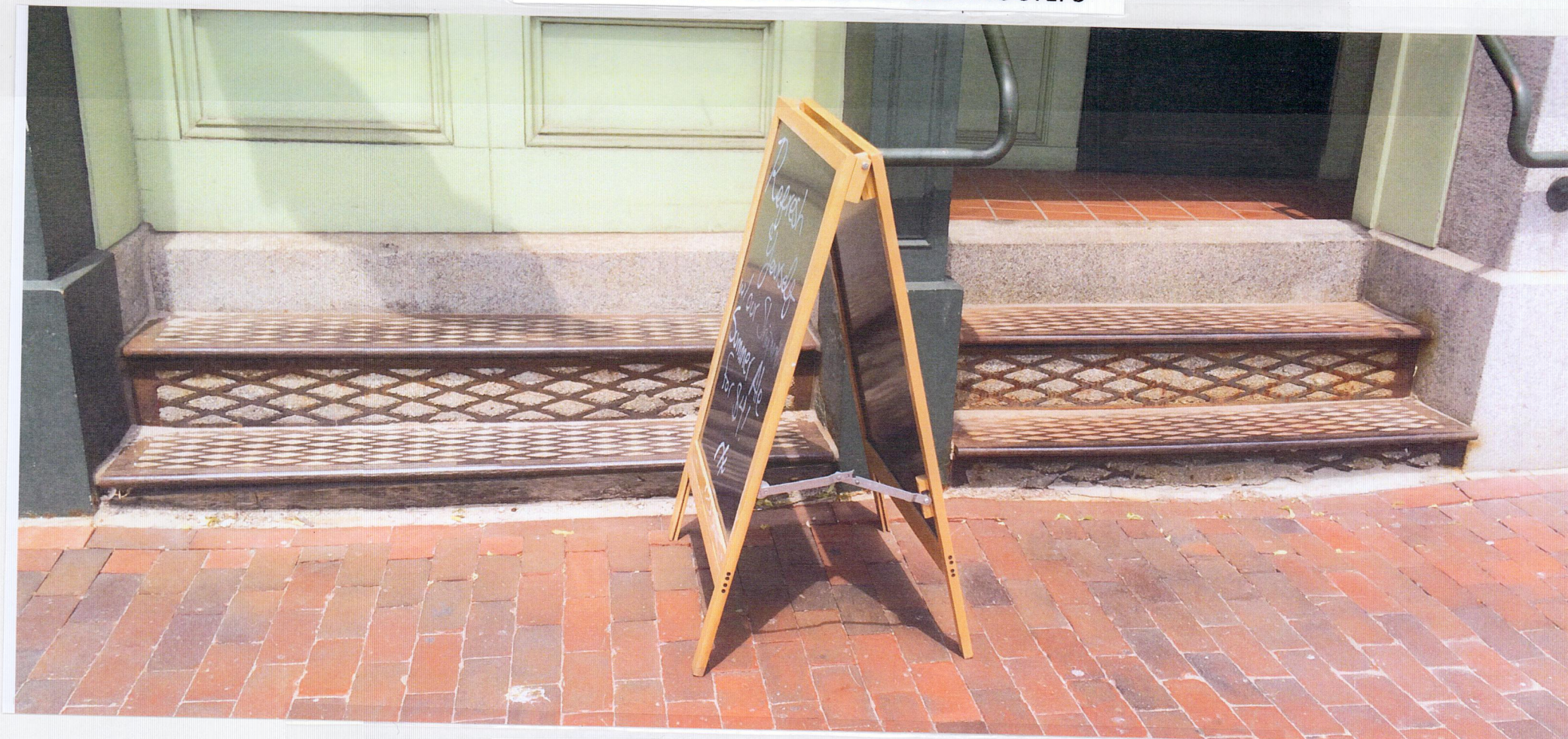
D- EXISTING STEPS AT 245 COMMERCIAL ST