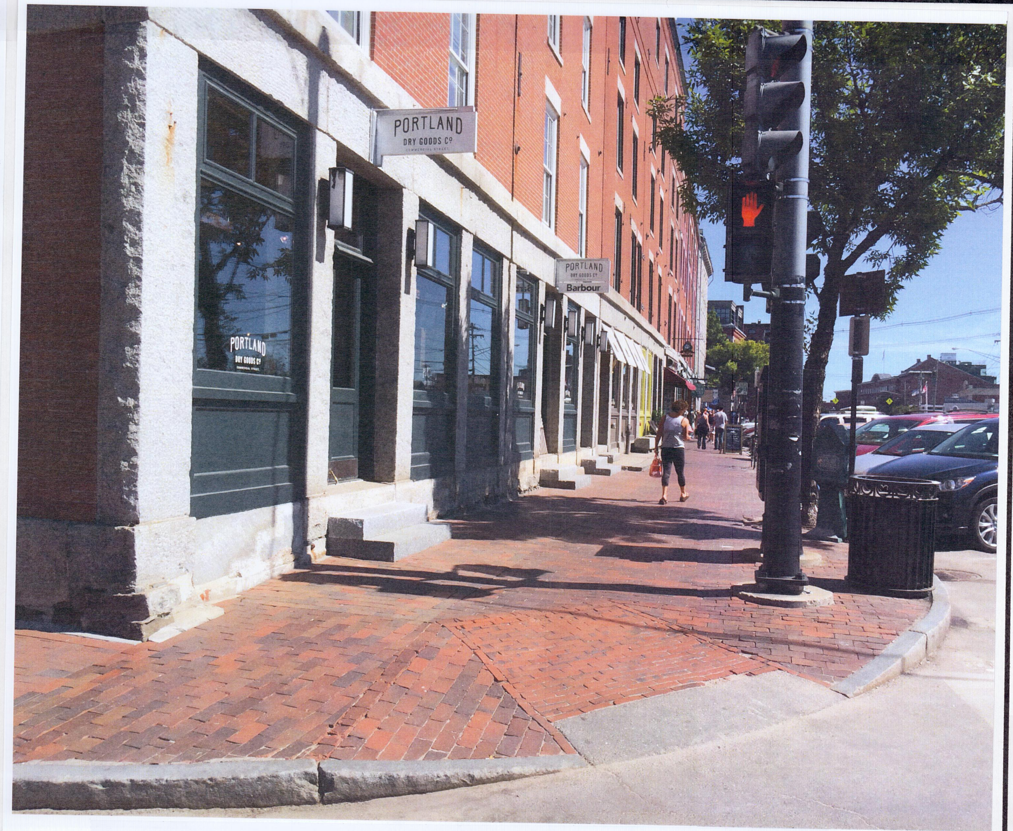
EXAMPLE - STEPS AT COMMERCIAL ST