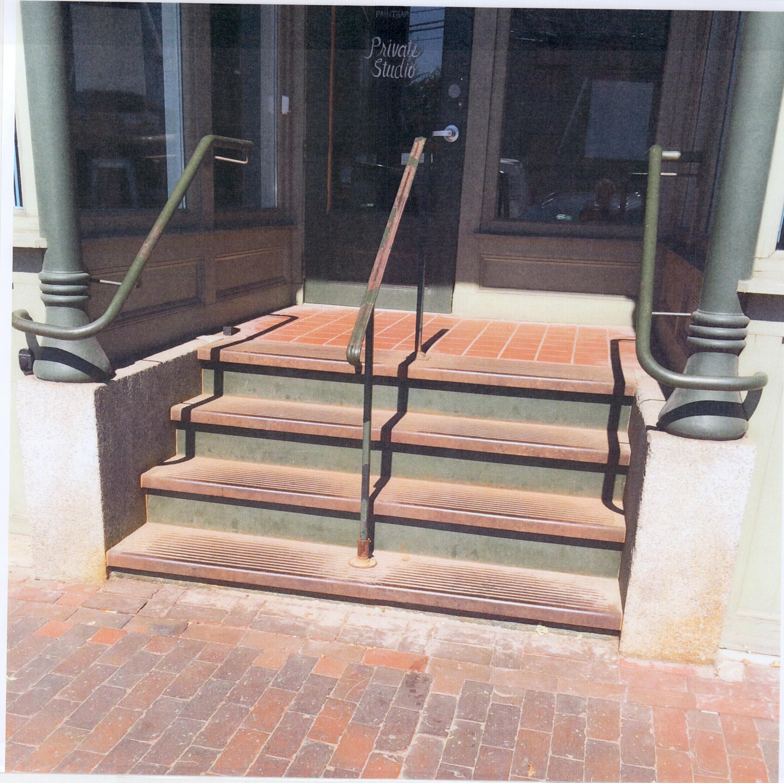
B - EXISTING STEPS AT 241 COMMERCIAL ST