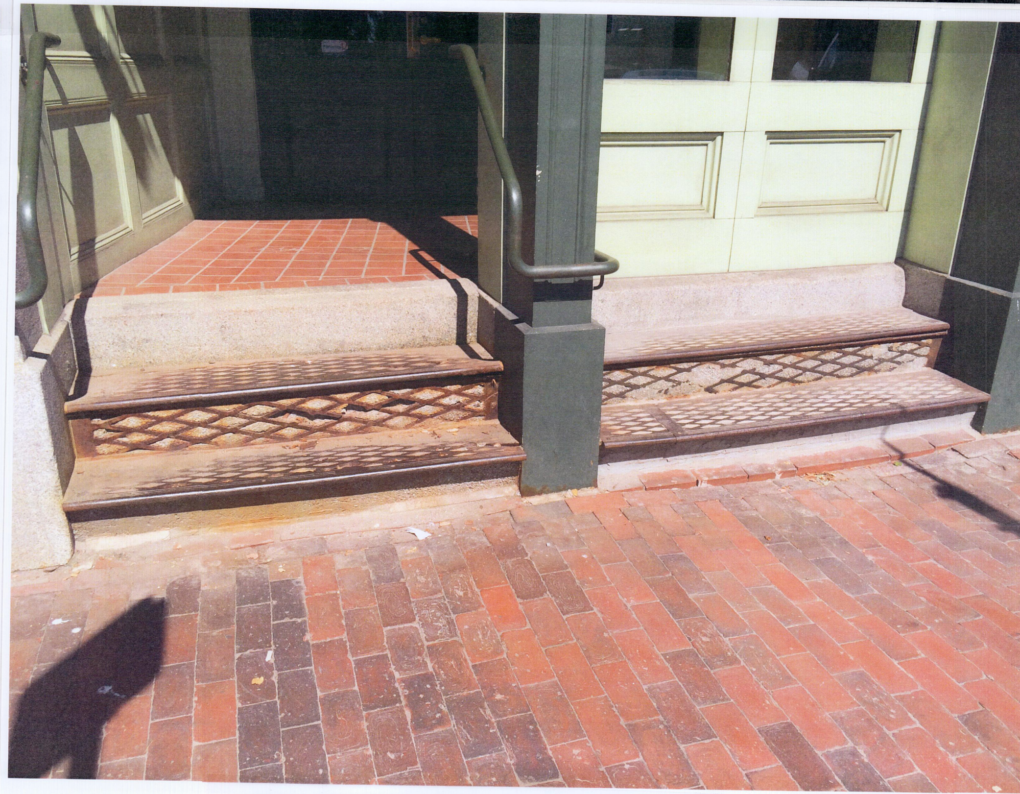
C- EXISTING STEPS AT 245 COMMERCIAL ST