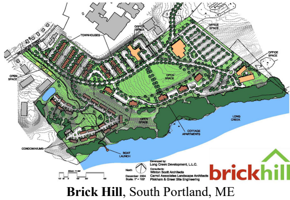
Brick Hill, South Portland, ME

Brickhill consisted of redevelopment of former Maine Youth Center into mixed use 'Smart Growth' project. The program for the 56 acre site includes 300 affordable housing apartments and condominiums, 250,000 SF of professional office space, recreation amenities including an 8 acre park, boat launch, community gardens, and hiking trails while preserving the historic brick structures on the site. The project is 100% completed in 2017. Carroll Associates provided Master Planning and Site Design Services for the project since 2001.