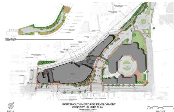
Harborcorp, Portsmouth, NH

The Forefront at Thompson's Point is a mixed-use development located on an existing vacant industrial site on the Fore River in Portland Maine. The original program consisted of a new Sports Event Centre, Concert Hall with an adjacent outdoor amphitheater seating 4500, a 235 room hotel, cultural center, restaurants, and approximately 180,000 sf of professional office space. Carroll Associates has been retained by the Developer to provide Master Planning and Landscape Architectural Services on the project.