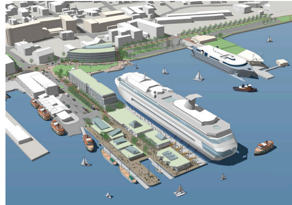
Oceangate and Maine State Pier Redevelopment

Brickhill consisted of redevelopment of former Maine Youth Center into mixed use 'Smart Growth' project. The program for the 56 acre site includes 300 affordable housing apartments and condominiums, 250,000 SF of professional office space, recreation amenities including an 8 acre park, boat launch, community gardens, and hiking trails while preserving the historic brick structures on the site. The project is 100% completed in 2017. Carroll Associates provided Master Planning and Site Design Services for the project since 2001.