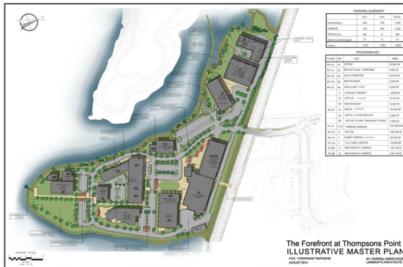
Forefront at Thompsons Point

Redevelopment of underutilized portion of Portland waterfront to provide new berthing for cruise ships and international ferry terminal. Oceangate Project includes extensive parking for ferry arrivals and departures, passengers, and tour busses; integration of adjacent narrow gauge railway, extension of existing streets to provide critical connections, and outdoor plazas and parks providing strong pedestrian connectivity to adjacent open space systems. Maine State Pier project includes redevelopment of aging waterfront pier and landside property to provide strong mixed use including office, retail, hotel, and a 2 acre park and with direct access to the waterfront.