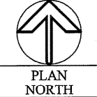
A17 KEY PLAN