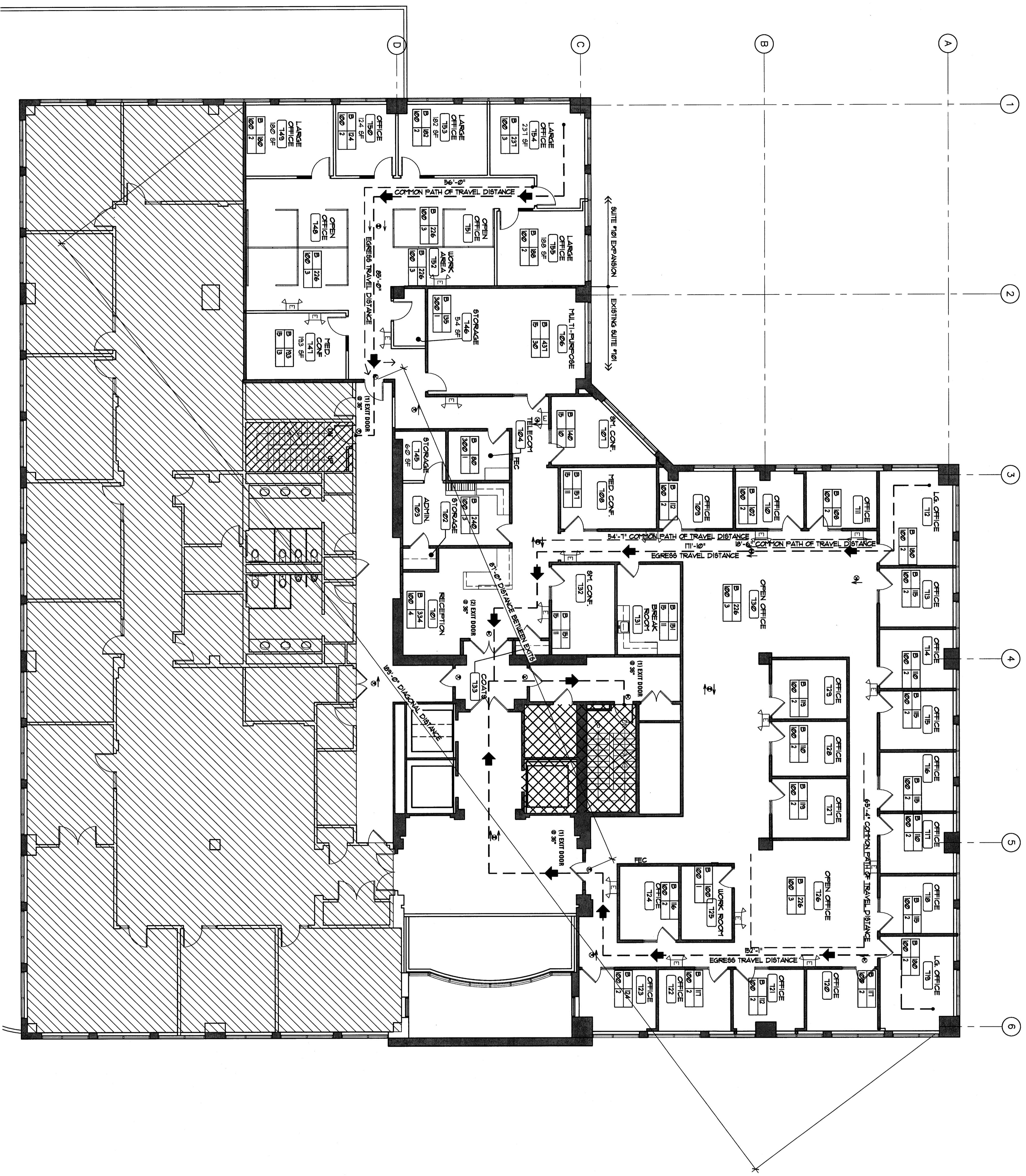
1 LEVEL 7 FLOOR PLAN

BUILDING USE: BUILDING IS MIXED USE WITH FIRST FLOOR RETAIL/RECREATION, AND THE REMAINDER OF THE BUILDING IS BUSINESS OCCUPANCY. BUILDING AREA: HEIGHT: 1 STORIES AREA: BUILDING TOTAL: 83,573 SF 7TH FLOOR: 20,000 SF TENANT SPACE: 531 SF FIRE PROTECTION: EXISTING BUILDING IS FULLY SPRINKLED EXISTING RATINGS WILL BE MAINTAINED.