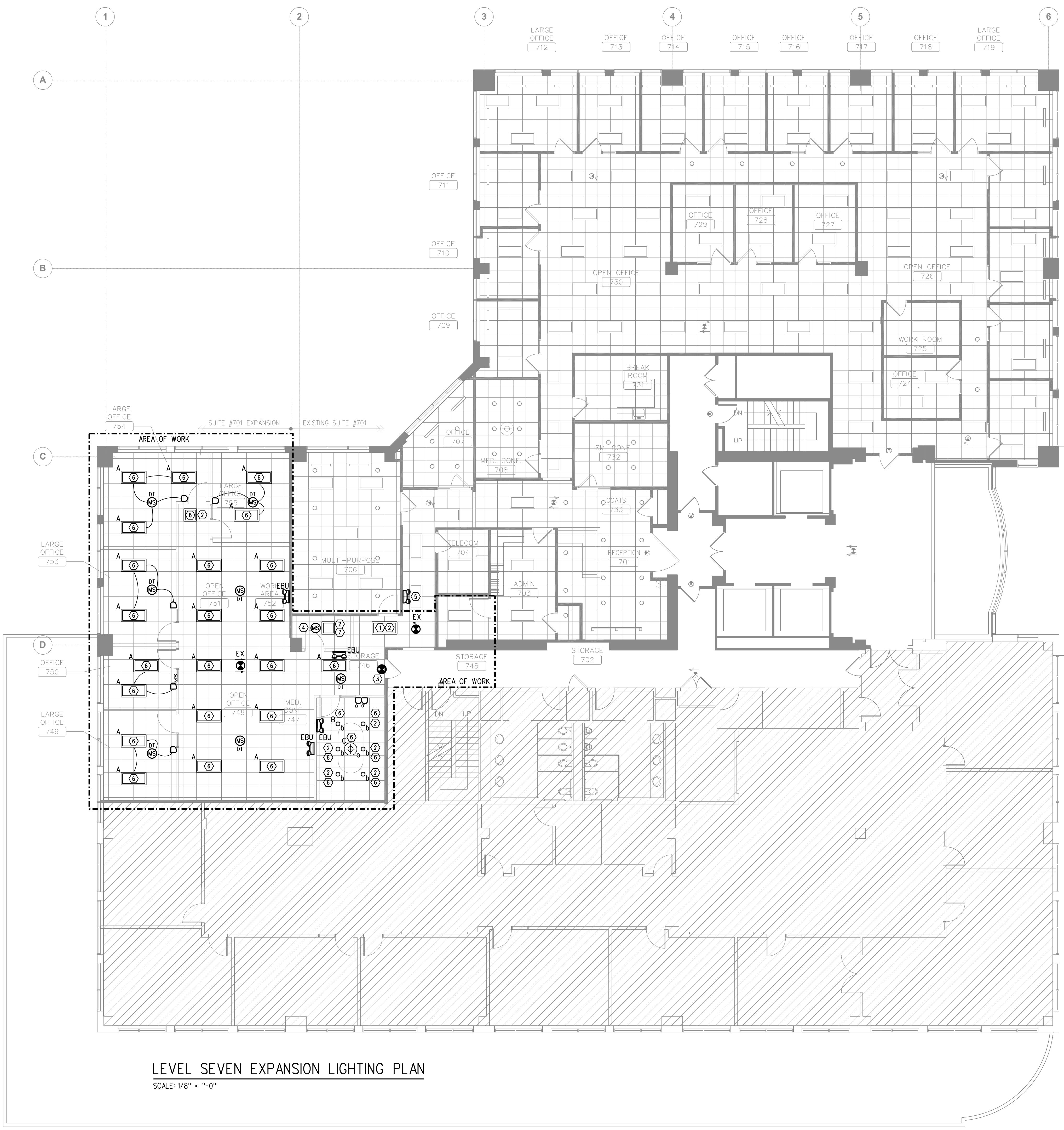
LEVEL SEVEN EXPANSION LIGHTING PLAN SCALE: 1/8" = 1'-0"