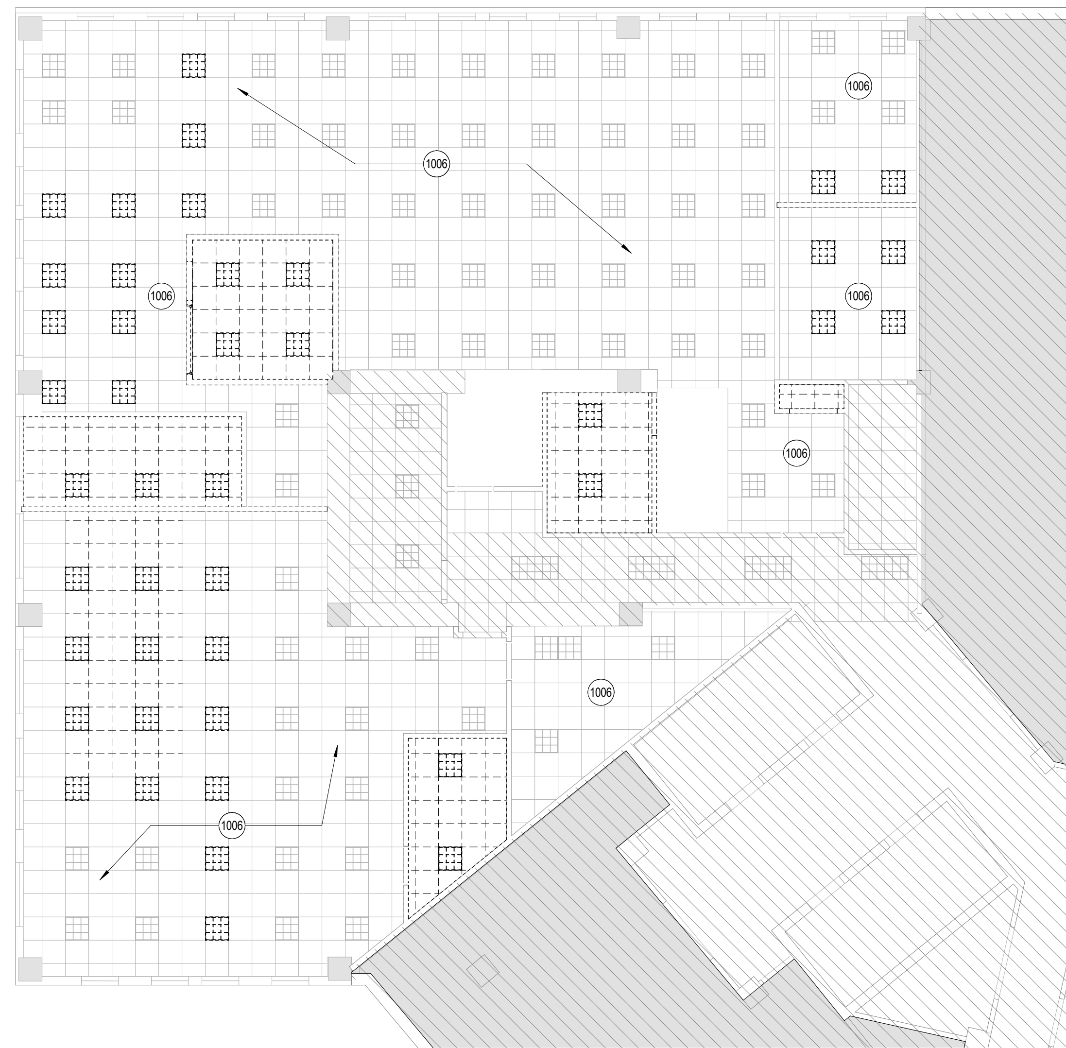
A1 DEMOLITION REFLECTED CEILING PLAN SCALE: 1/8" = 1'-0"

12/28/2017 2:45:54 PM C:\Users\jdoan\OneDrive\Documents\171113262000 Charter One Portland.mxd.plt