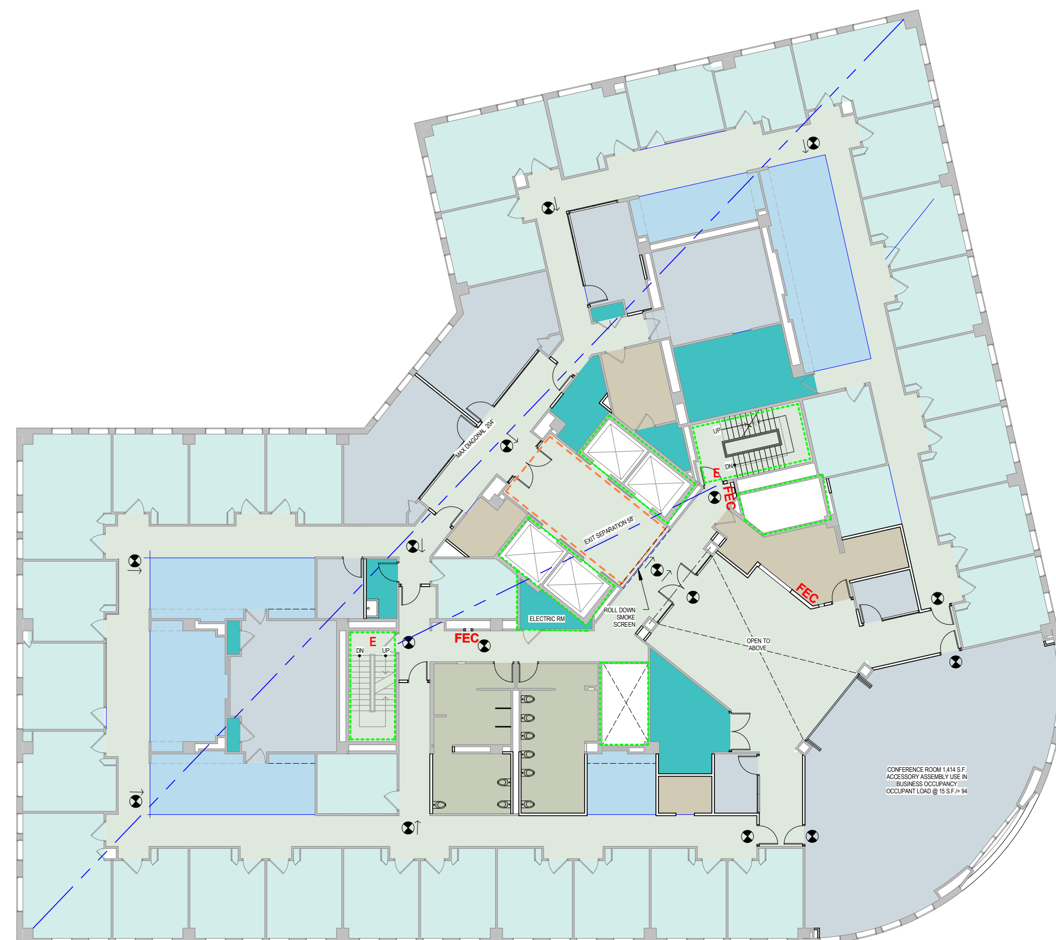
3 FLOOR 9 LIFE SAFETY PLAN 1/16" = 1'-0"