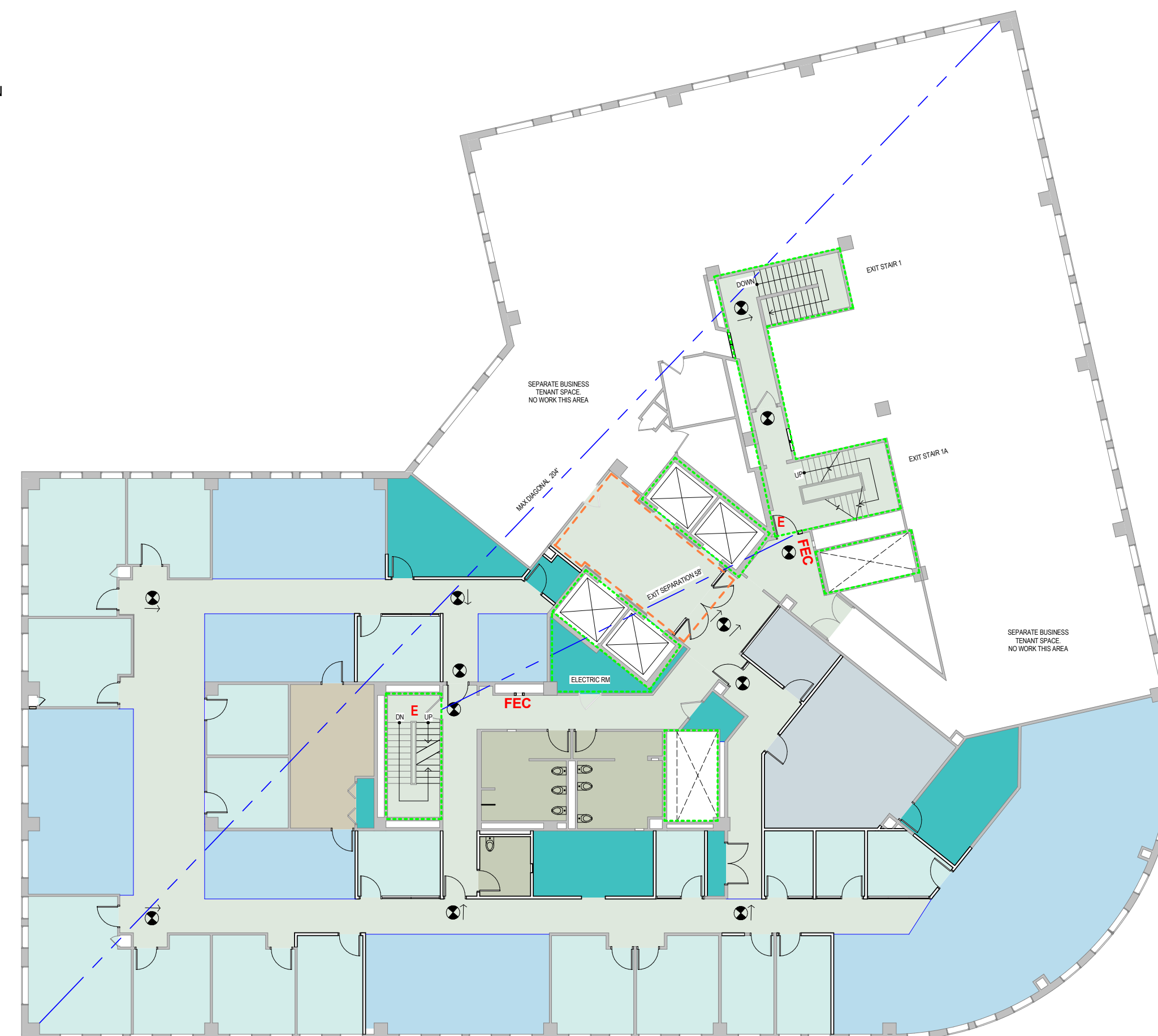
1 FLOOR 7 LIFE SAFETY PLAN 1/16" = 1'-0"

THIS DRAWING IS THE PROPERTY OF CANAL 5 STUDIO AND IS NOT TO BE COPIED OR REPRODUCED IN PART OR WHOLE. 2014 © CANAL 5 STUDIO