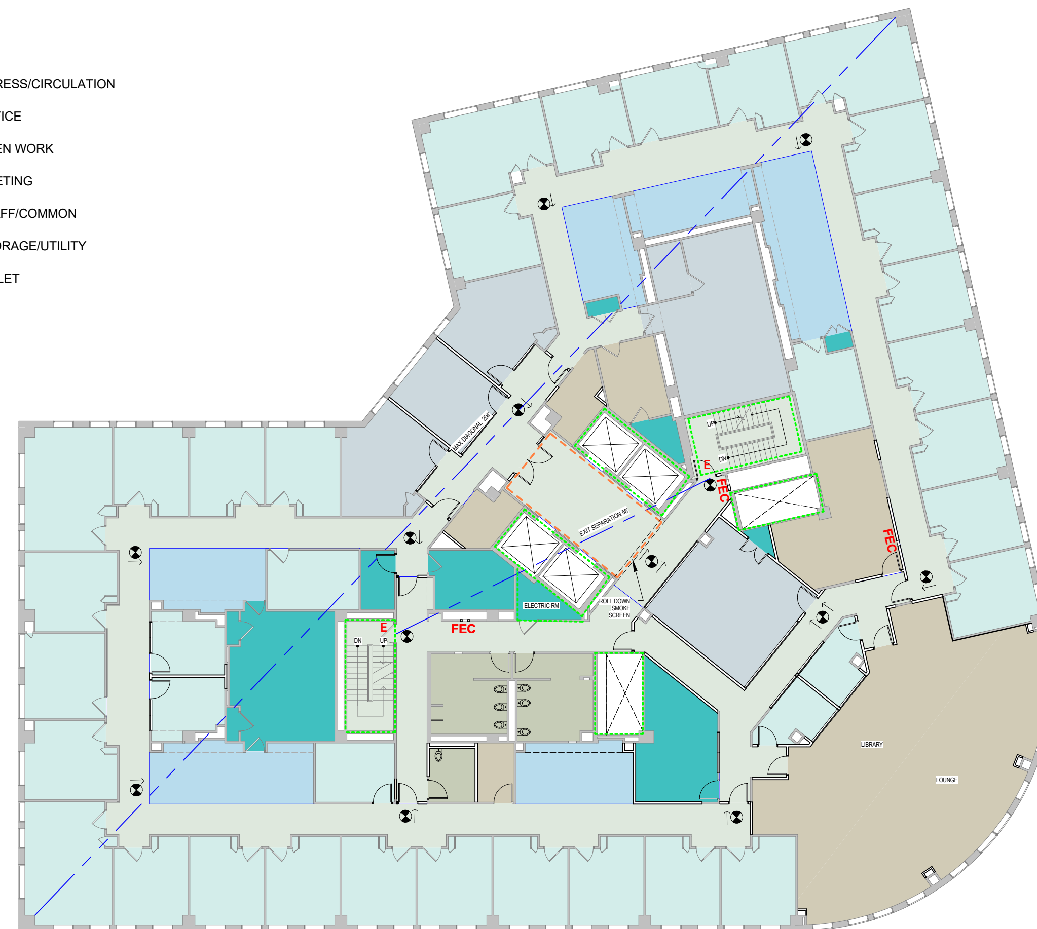
2 FLOOR 8 LIFE SAFETY PLAN 1/16" = 1'-0"