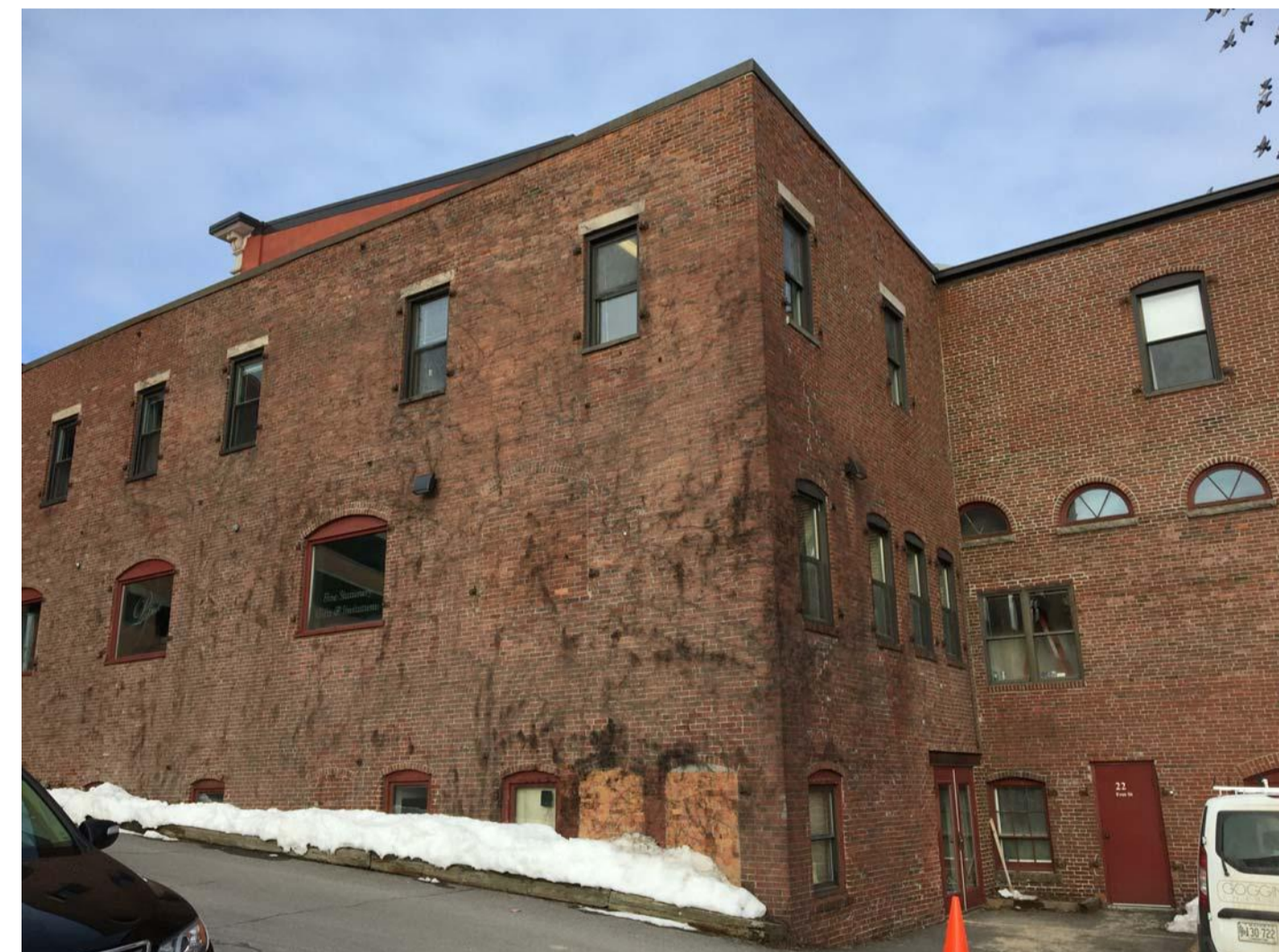
WEST & SOUTH ELEVATION - FROM PARKING LOT