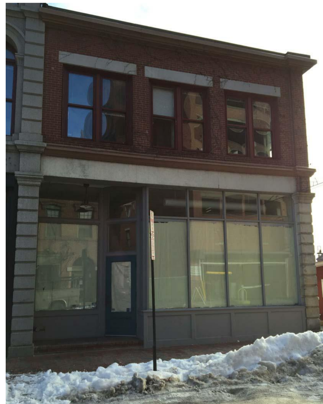
NORTH ELEVATION - FROM FREE STREET