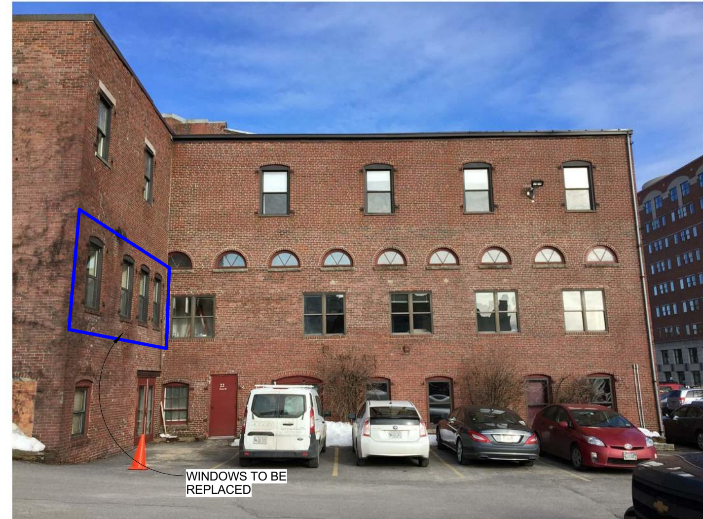
WINDOWS TO BE REPLACED